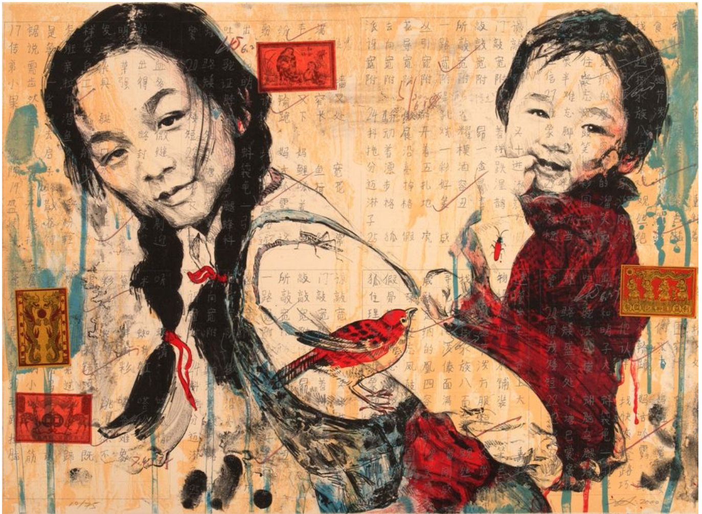
Hung Liu (China), Sisters , 2000.

De-dollarisation was moving at a very slow pace until 2022, when the Global North countries began to confiscate Russian assets held in the Dollar-Wall Street financial system and anxiety spread across many countries about the safety of their assets in the North American and European banks. Though this confiscation was not new (the United States has done this before to Cuba and Afghanistan, for instance), the scale and severity of these confiscations operated as a ‘confidence-destroying’ measure, as Nogueira puts it.