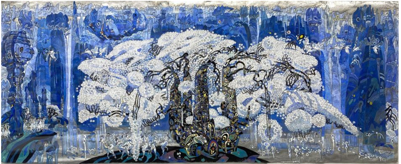
Jiang Tiefeng (China), Stone Forest , 1979.