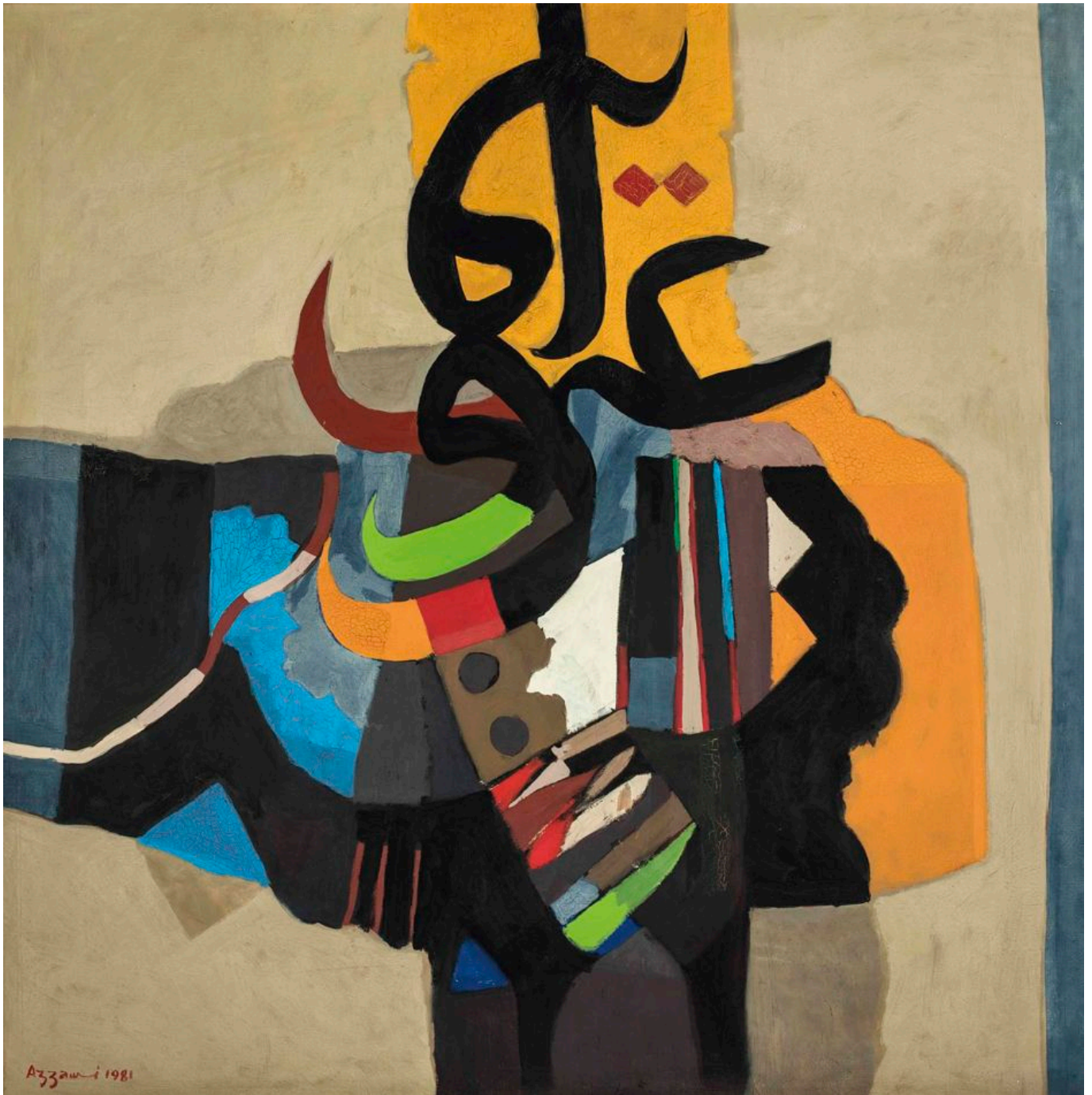
Dia Al-Azzawi (Iraq), Ijlal li Iraq ('Homage to Iraq'), 1981.

In the aftermath of the US nuclear strikes on Hiroshima and Nagasaki in 1945, the World Peace Council issued the Stockholm Appeal: