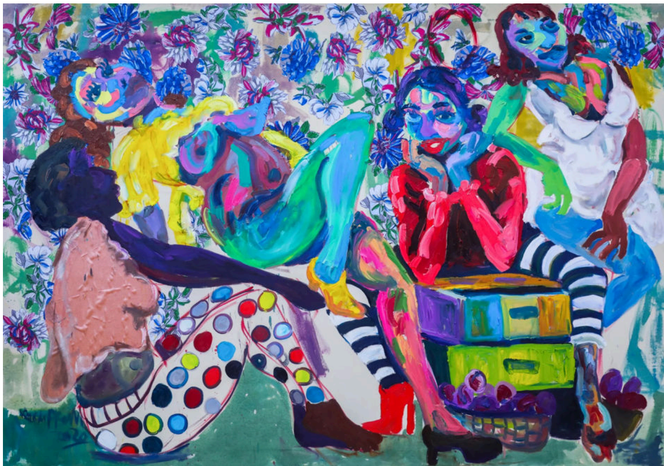
Wycliffe Mundopa (Zimbabwe), Easy Afternoon , 2020.

The way teachers have been treated during the pandemic illustrates the low level of importance given to this crucial job and education more broadly in our global society. Only in 19 countries were teachers placed in the first priority group with frontline workers to receive the COVID-19 vaccine.