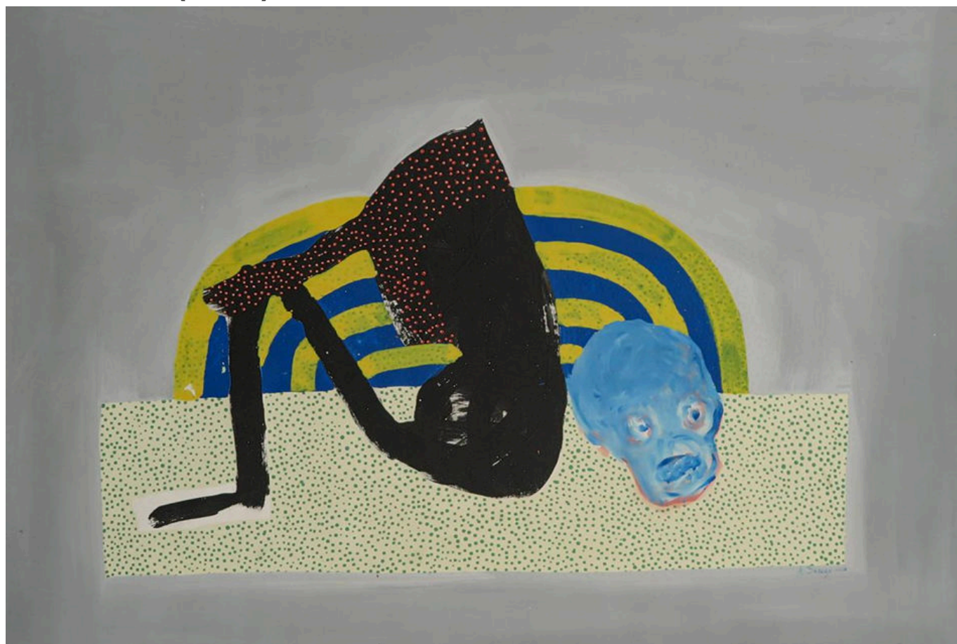
Amadou Sanogo (Mali), Je pense de ma tête , 2016.