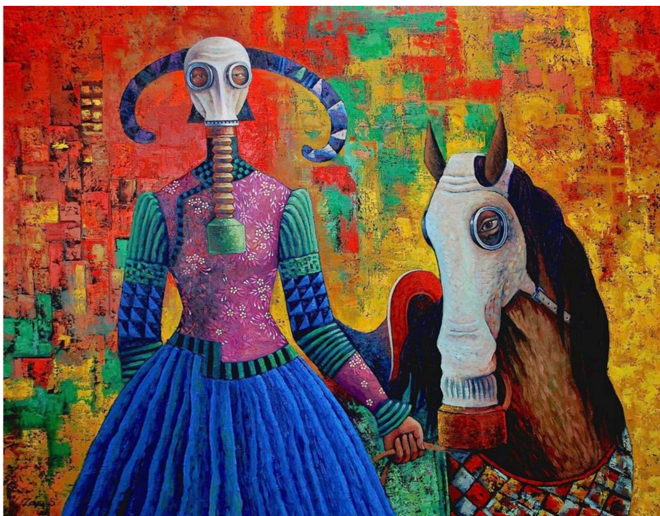
Zayasaikhan Sambuu (Mongolia), Survivors , 2013.

South amongst all classes. Yet, for the first time in decades, young Africans have come out to support the expulsion of French troops in Mali and Burkina Faso in West Africa. For the first time, the popular classes in Colombia were able to elect a new government that rejected the country's status as a vassal outpost of US military and intelligence forces. Working-class women are at the forefront of many critical battles of both the working class and society at large. Young people are rising up against the environmental crimes of capitalism. Growing numbers of the working class are identifying their struggles for peace, development, and justice as explicitly anti-imperialist. They are now able to see through the lies of US 'human rights' ideology , the destruction of the environment by Western energy and mining companies, and the violence of US hybrid war and sanctions.