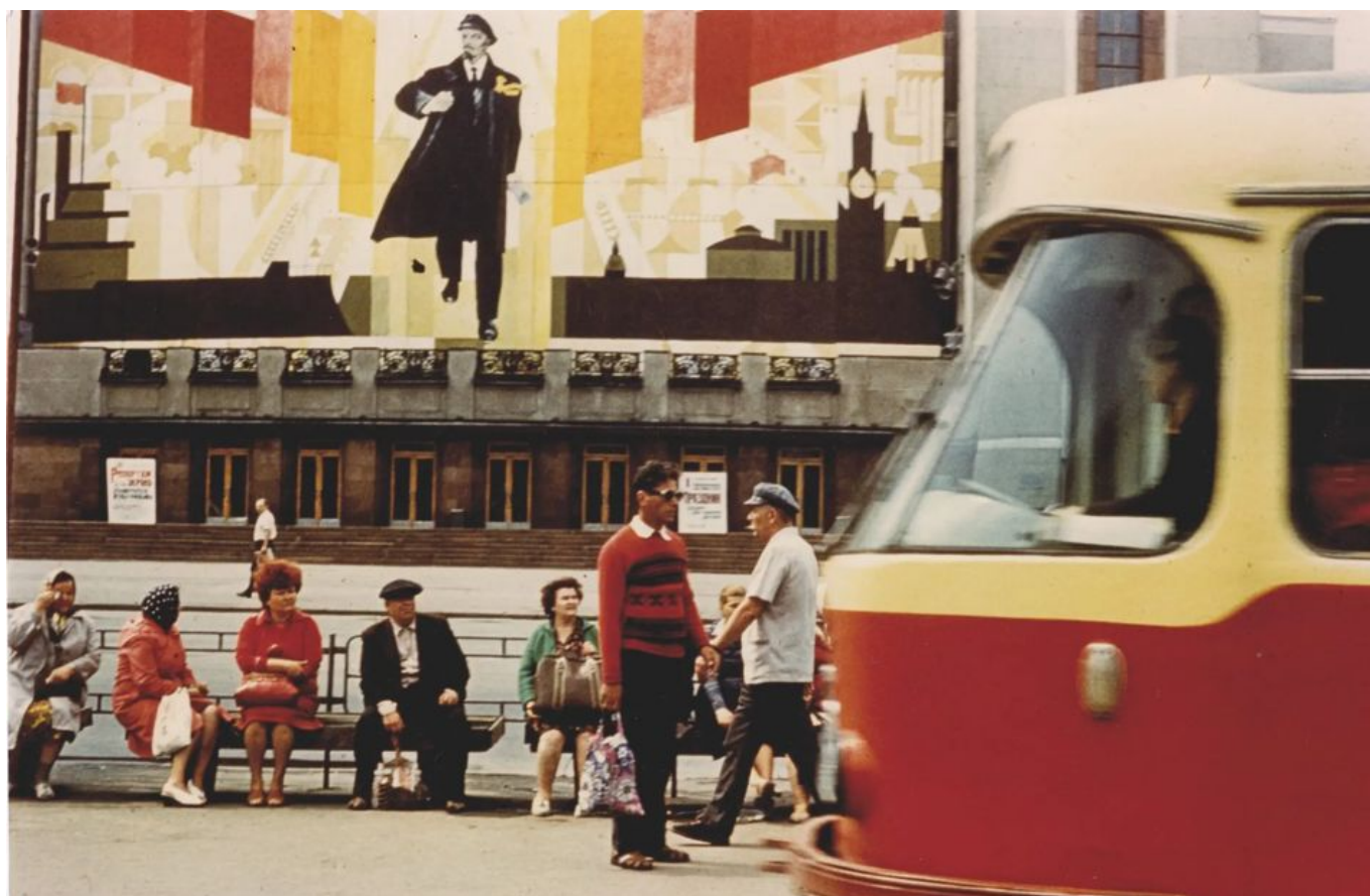
Boris Mikhailov (Ukraine SSR), Red , 1968-1975.