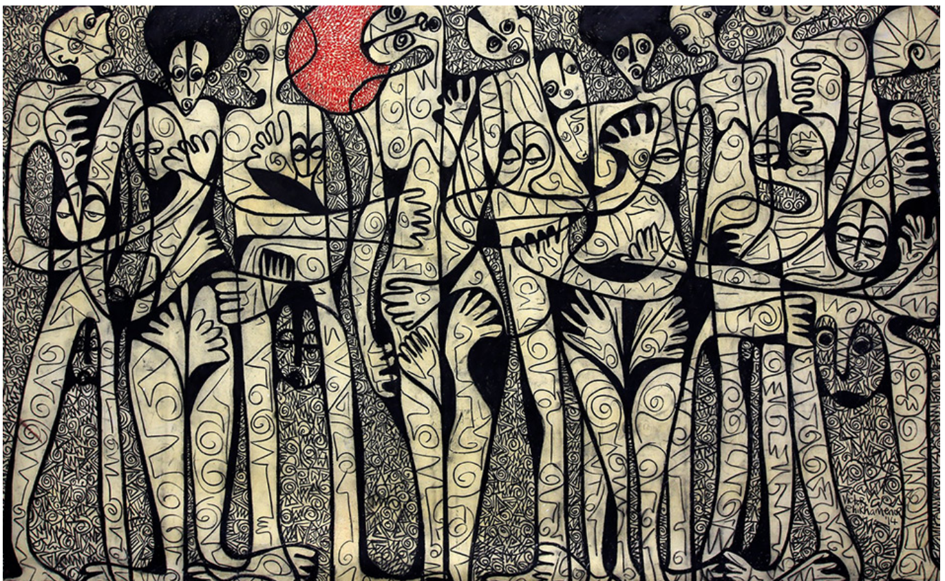
Victor Ehikhamenor (Nigeria), Lagos Hide and Seek , 2014.

The inexorable path of this system is to destroy the planet and human life, threaten nuclear annihilation, and work against the needs of humanity to collectively reclaim the planet's air, water, and land and stop the nuclear military madness of the United States. Capitalism rejects planning and peace. The Global South (including China) can help the world build and expand a 'zone of peace' and commit to living in harmony with nature.