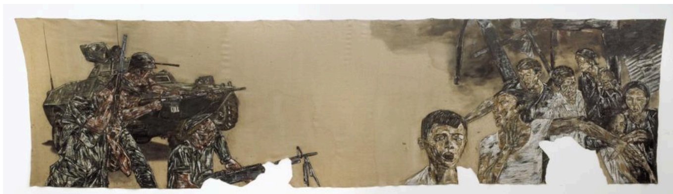
Leon Golub (USA), Vietnam II , 1973.