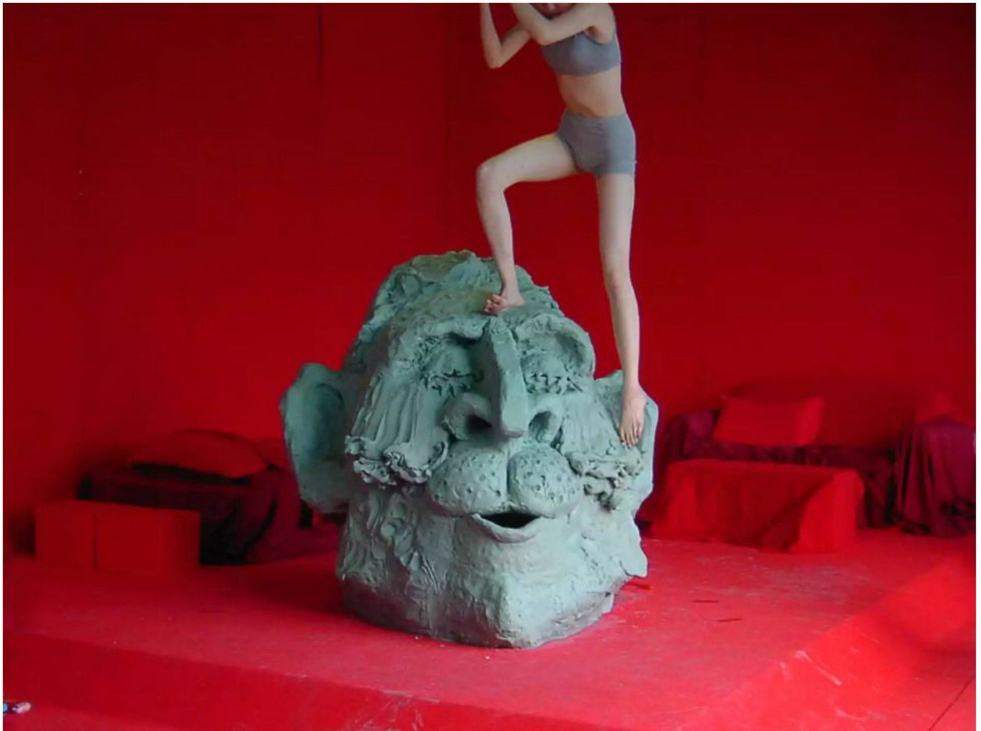
Tadasu Takamine (Japan), Still frame from: ' God Bless America ', 2002.

UK Prime Minister Rishi Sunak was given the errand to warn China about its 'economic coercion' as he unveiled the G7 Coordination Platform on Economic Coercion to track Chinese commercial activities. 'The platform will address the growing and pernicious use of coercive economic measures to interfere in the sovereign affairs of other states', Sunak said. This bizarre language displayed neither self-awareness of the West's long history of brutal colonialism nor an acknowledgement of neocolonial structures – including the permanent state of indebtedness enforced by the International Monetary Fund (IMF) – that are coercive by definition. Nonetheless, Sunak, Biden, and the others preened with self-righteous certainty that their moral standing remains intact and that they hold the right to attack China for its trade agreements. These leaders suggest that it is perfectly acceptable for the IMF – on behalf of the G7 states – to demand 'conditionalities' from debt-ridden countries while forbidding China from negotiating when it lends money.