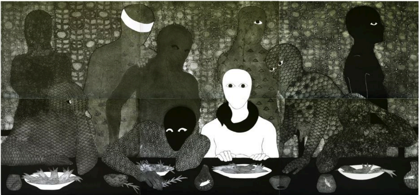
Belkis Ayón (Cuba), La cena ('The Supper'), 1991.

$105 billion (in addition to the – likely underreported – $858-billion military budget for 2023) includes $61.4 billion for the grinding war in Ukraine and $14.1 billion for the Israeli genocide of the Palestinians. Though peace talks opened between Ukrainian and Russian authorities in both Belarus and Turkey days after Russian troops entered Ukraine, these talks were hastily scuttled by NATO, fuelling the conflict that has resulted in nearly 10,000 civilian deaths so far. The civilian death toll in Ukraine during one year and eight months of the conflict has already been surpassed by the civilian death toll in Palestine in merely four weeks.