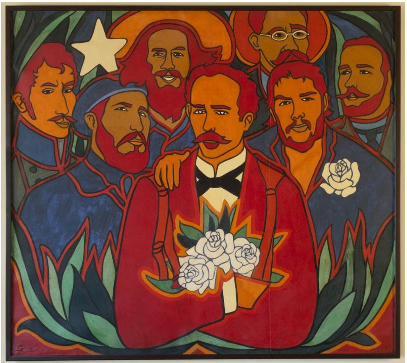
Raúl Martínez (Cuba), Rosas y Estrellas ('Roses and Stars'), 1972.

its Gross Domestic Product on education, while the US spent 5.4%. Not only are all schools free for Cuban children, but all Cuban children receive meals at school and are given their uniforms. Medical education is also free in Cuba, creating a high doctor-to-patient ratio of 8.4 physicians and 7.1 nurses for every 1,000 Cubans. At the UN General Assembly, Cuba's Foreign Minister Bruno Rodríguez Parrilla said that 'attention to the human being has been and will continue to be the priority of the Cuban government'. The blockade might be 'economic warfare', he said, but the Cuban Revolution – which has faced this 'economic siege' for decades – will not wilt. It will stand firm.