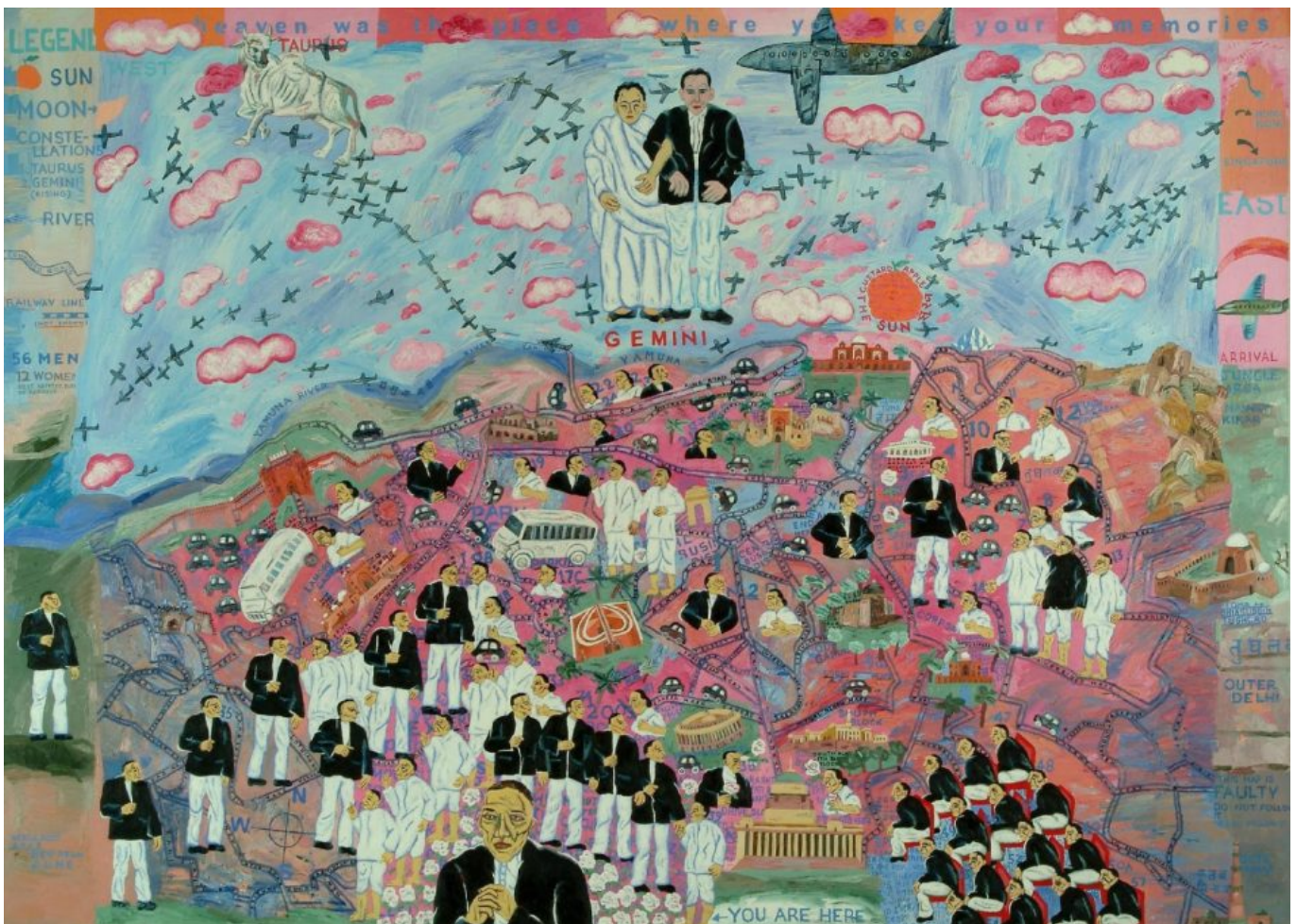
Arpita Singh (India), My Lollypop City: Gemini Rising , 2005.