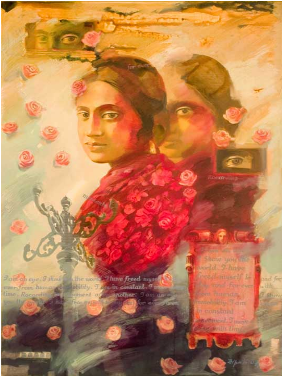
Dipali Bhattacharya (India), Untitled , 2007.

On 13 August, the Calcutta High Court ordered the police to hand over the case to the Central Bureau of Investigation. On the night of 14 August, vandals destroyed a great deal of campus property, attacked doctors who were holding a midnight vigil, threw stones at nearby police, and destroyed evidence that remained on the scene, including the seminar room where the doctor was found, suggesting an attempt to disrupt any investigation. In response to the attack, FORDA resumed its strike.