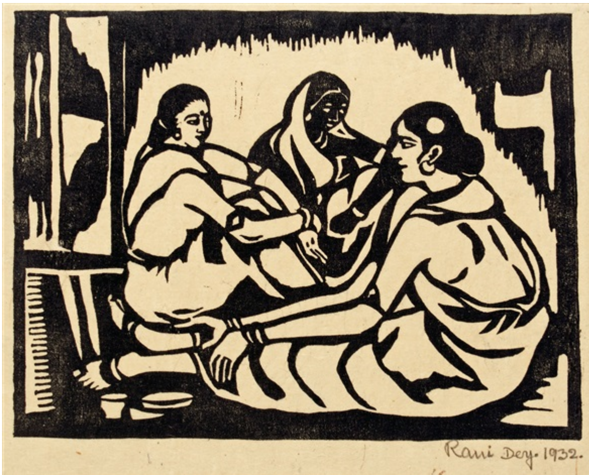
Rani Chanda (India), The Solace , 1932.

On 10 August, the day after the young doctor's body was discovered, the DYFI, Students Federation of India (SFI), Communist Party of India (Marxist), and other organisations held protests across West Bengal to ensure justice. These protests grew rapidly, with medical personnel across the state, and then across India, standing outside their workplaces with placards expressing their political anger. The women's movement, which saw massive protests in 2012 after a young woman in Delhi was gang raped and murdered, again took to the streets. The number of young women who attended these protests reflects the scale of sexual violence in Indian society, and their speeches and posters were saturated with sadness and anger. 'Reclaim the night', tens of thousands of women shouted in protests across West Bengal on 14 August, India's independence day.