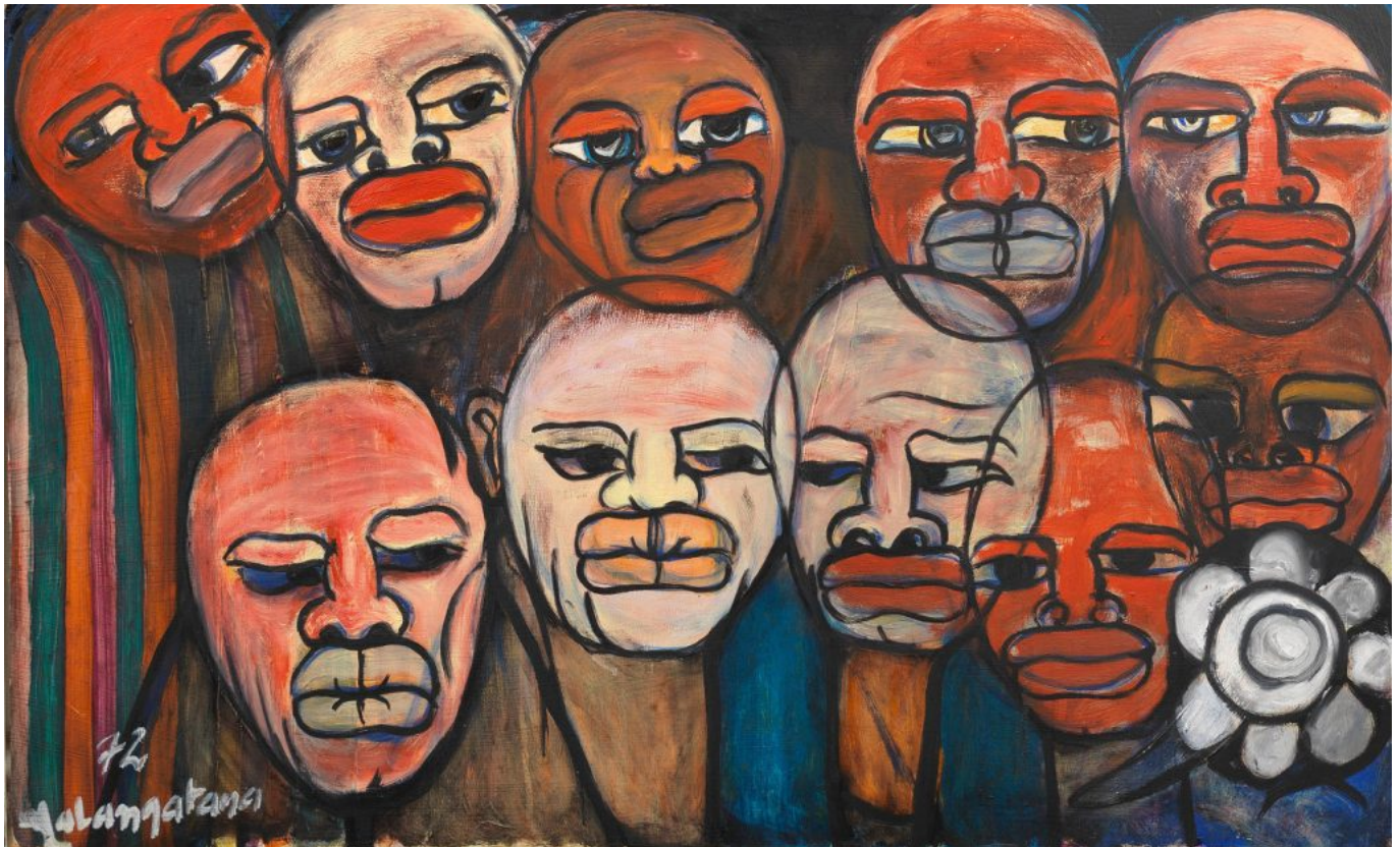
Malangatana Valente Ngwenya (Mozambique), Faces , 1972.

information warfare and trade policy as well. In particular, he has proposed a minimum 10-20% tariff on all imports into the United States and a steep 60% tariff on those from China. This would sharply increase consumer prices and thereby cost the average household around $3,000 per year according to the Tax Policy Center.