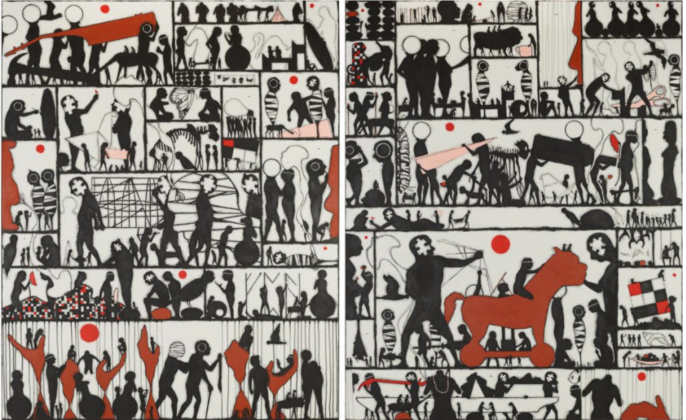
Andy Leleisi'uao (Aotearoa), Harmonic People , 2017.

maintaining a globe-spanning empire of over 900 military bases, investing $175 billion into the proxy war in Ukraine and $18 billion into Israel's genocide, and when the actual military spending stands at more than double the official figure – an astounding $1.5 trillion in 2022 alone. Trumpism, in all its paradoxical extremes of isolationism and belligerence, populism and nativism, is but another morbid symptom of this violent imperial decline.