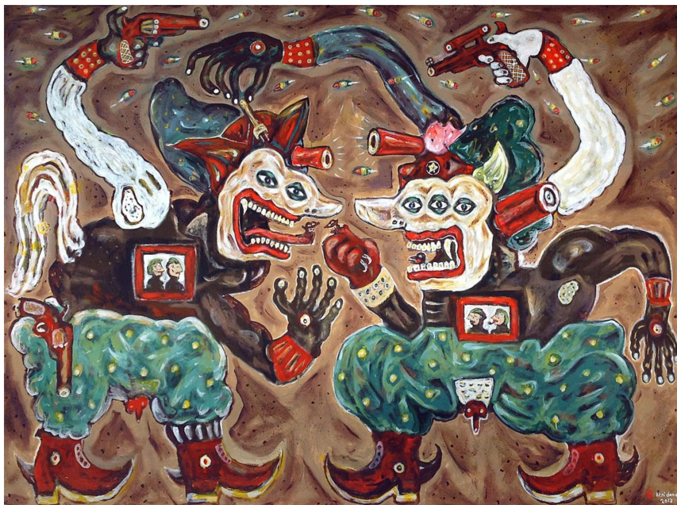
Heri Dono (Indonesia), Two Guards Who Protect Their Leaders , 2013.