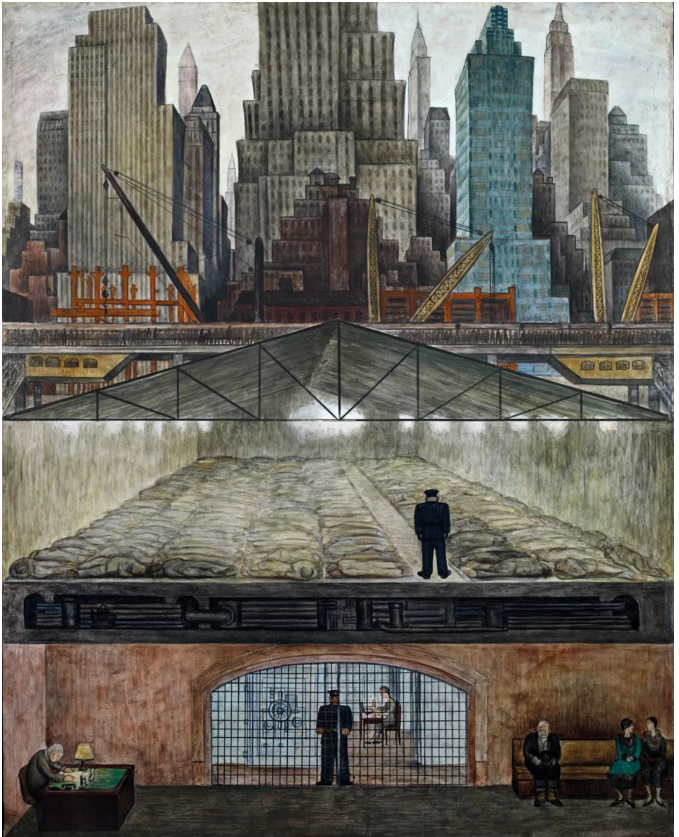
Diego Rivera (Mexico), Frozen Assets , 1931.