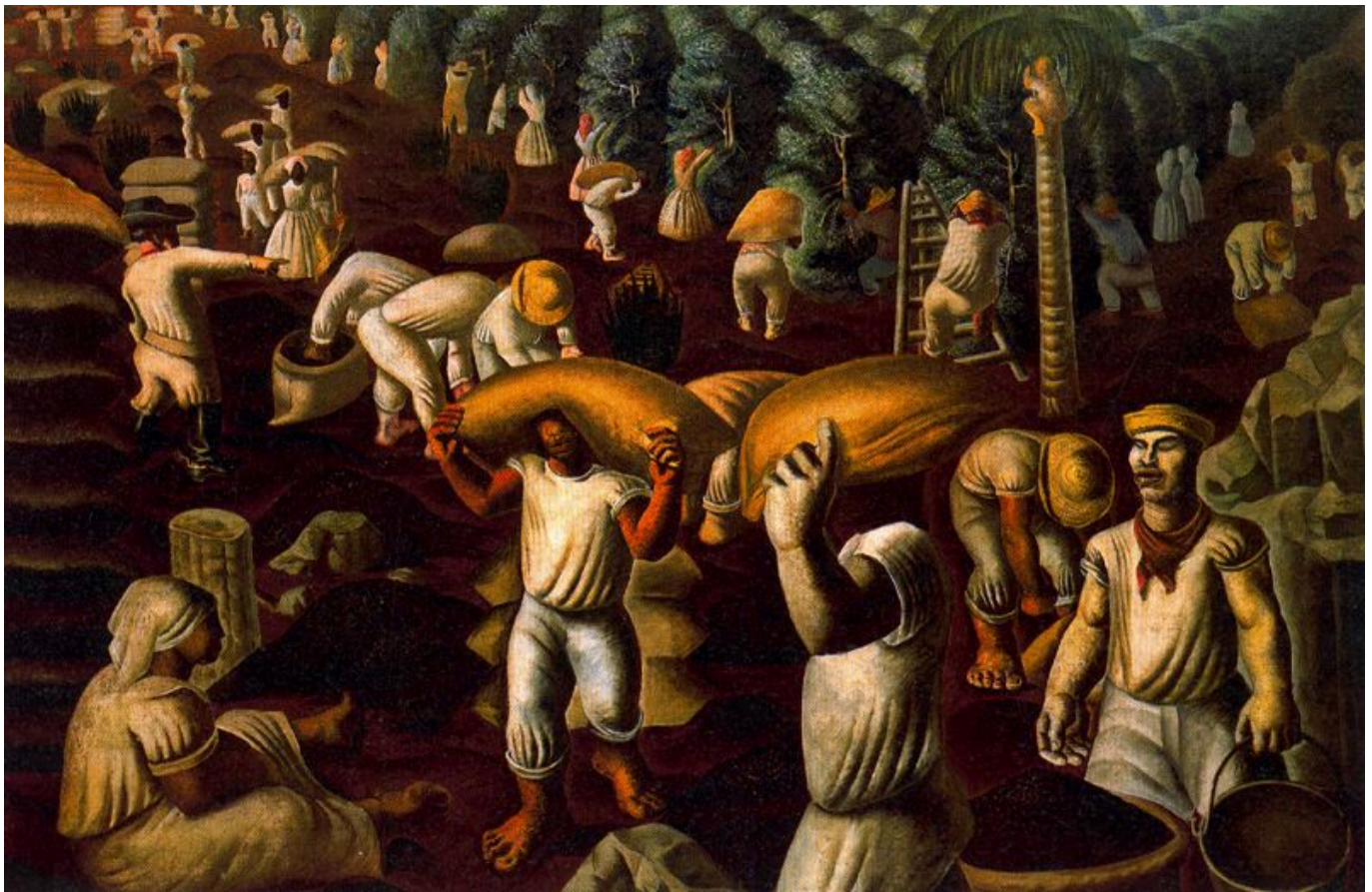
Cândido Portinari (Brazil), Coffee Bean Mowers , 1935.

These assessments come from people at the heart of powerful global institutions – the IMF, World Bank, WEF, and the UN (and even from a queen). Although they all recognise the structural nature of the crisis, they are reluctant to be honest about the underlying economic processes, or even about how to adequately name the situation. David M. Rubenstein, the head of global investment firm The Carlyle Group, said that when he was part of US President Jimmy Carter’s administration, their inflation advisor Alfred Kahn warned them not to use the ‘R’ word – recession – which ‘scares people’. Instead, Kahn advised, use the word ‘banana’. Along those lines, Rubenstein said of the current situation, ‘I don’t want to say we’re in a banana, but I would say a banana may not be that far away from where we are today’.