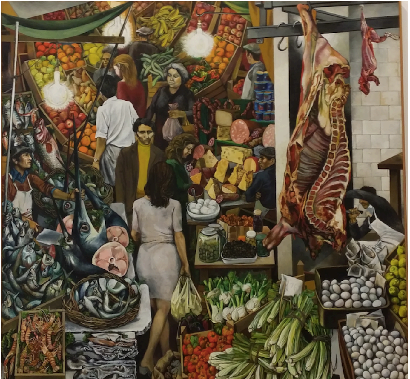
Renato Guttuso (Italy), La Vucciria , 1974.

The World Bank reports that food and fuel prices will remain at very high levels until at least the end of 2024. As wheat and oilseed prices have escalated, reports are coming in from across the globe – including in wealthy countries – that working-class families have started to skip meals. This tense food situation has led United Nations (UN) Secretary-General’s Special Advocate for Inclusive Finance for Development, Queen Máxima of the Netherlands, to predict that many families will move to one meal a day, which, she says, ‘will be the source of even more instability’ in the world. The World Economic Forum (WEF) adds that we are in the midst of ‘a perfect storm’ if you take into account the impact of increasing interest rates on mortgage payments as well as inadequate salaries. The managing director of the International Monetary Fund (IMF), Kristalina Georgieva-Kinova, said late last month that the ‘horizon has darkened’.