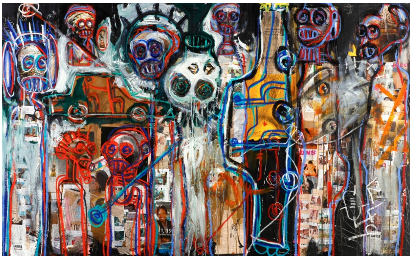
Aboudia (Côte d'Ivoire), Untitled , 2013.

Ghastly is the way of inflation, but inflation is merely the symptom of a deeper problem and not its cause. That problem is not merely the war in Ukraine or the pandemic, but something that is confirmed by data but denied in press conferences: the capitalist system, plunged into a long-term depression, cannot heal itself. Later this year, notebook no. 4 on the theory of crisis from Tricontinental: Institute for Social Research, written by Marxist economists Sungur Savran and E. Ahmet Tonak, will establish these points very clearly.