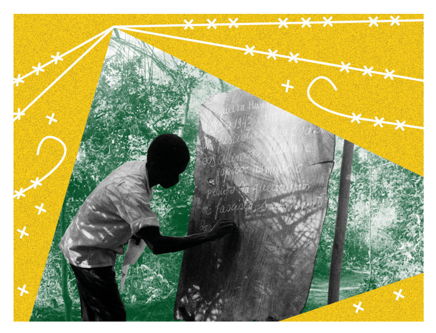
A teacher writes on a blackboard at a PAIGC school in the liberated areas in the Guinean forests, 1974.

Looking to the national liberation experiments of an earlier era reveals an utterly different set of values, which prioritised ending hunger, increasing literacy, and ensuring other social advances that enhanced human dignity. From Tricontinental: Institute for Social Research comes a new series called Studies in National Liberation. The first study in this series, The PAIGC's Political Education for Liberation in Guinea-Bissau, 1963–74 , is a fabulous text based on the archival research of Sónia Vaz-Borges , a historian and the author of Militant Education, Liberation Struggle, and Consciousness: The PAIGC education in Guinea Bissau, 1963–1978 (Peter Lang, 2019).