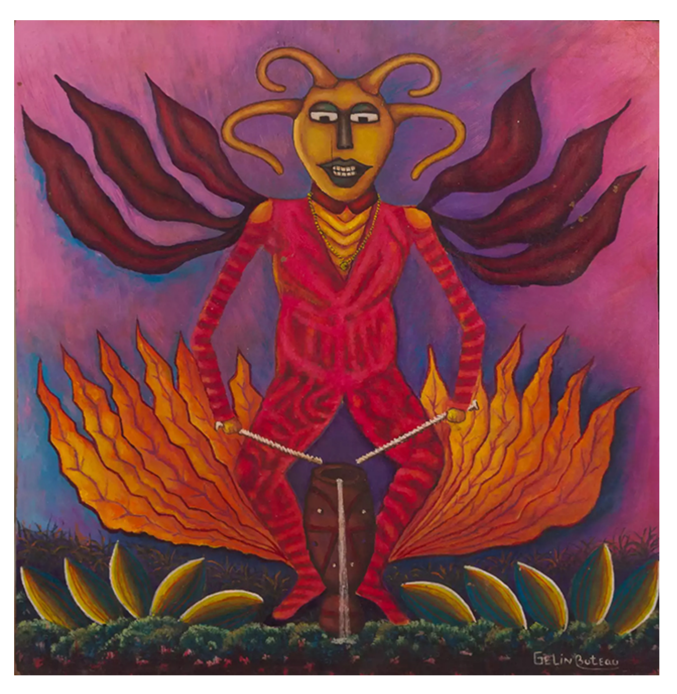
Gélin Buteau (Haiti), Guede with Drum, ca. 1995.