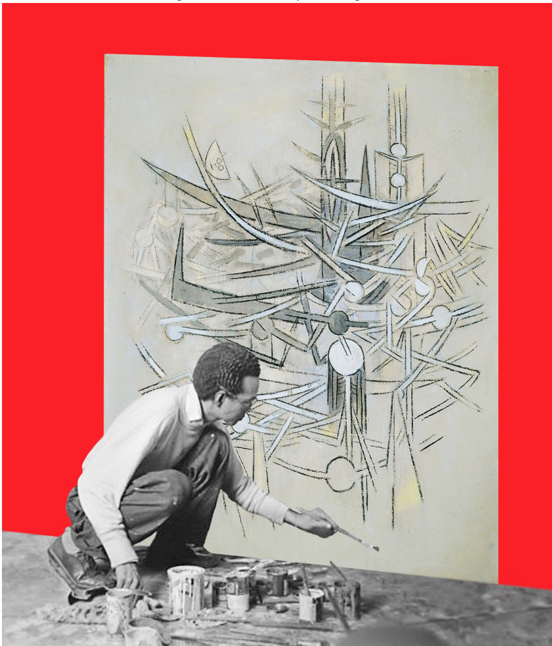
Wifredo Lam, La Barrière or The Obstacle , 1964.