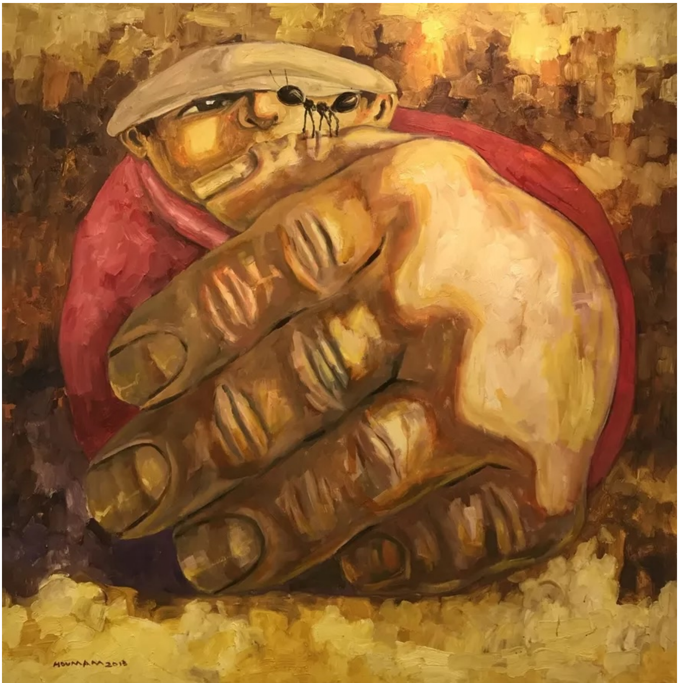
Houmam al-Sayed (Syria), Namle , 2012.