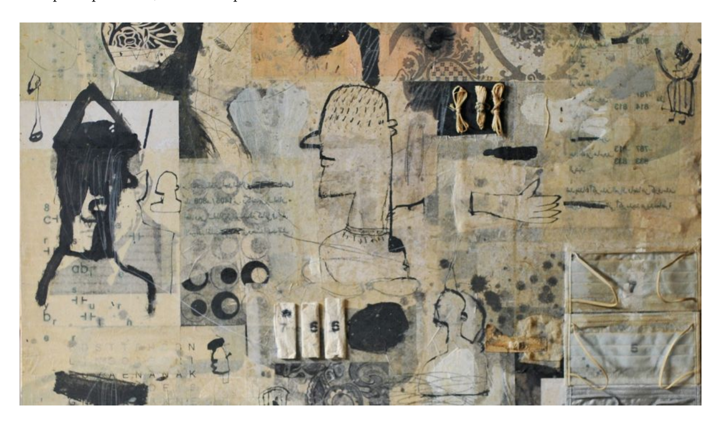
Mahmud al-Obaidi (Iraq), Untitled, 2008.

The analysis in the texts is detailed, relying upon public databases and databases built by GSI. The bottom line is that there is one world system that is managed dangerously by an imperialist bloc. There are no multiple imperialisms, no inter-imperialist conflict.