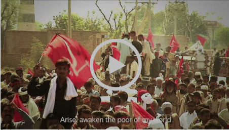
Arise, awaken the poor of every world

Our friends in the Pakistani band Laal sang a lovely version of this poem during the Anjuman Muzareen (Tenant Association) March for land rights in 2010. You can watch it below.