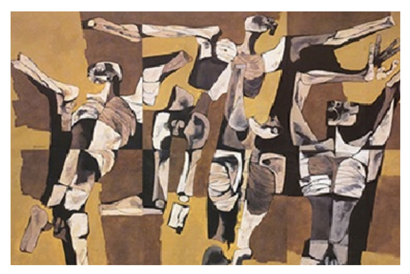
Oswaldo Guayasamin, Los Mutilados, 1976.

Ecuador has dissolved into a crisis. The government moved on its bargain with the IMF to slash subsidies and to deepen its austerity policies. Fuel prices skyrocketed. Enormous numbers of people came onto the streets on 3 October. The State forces acted with violence, firing tear gas and arresting hundreds of people. President Lenin Moreno has declared a State of Emergency, which is to last for sixty days.