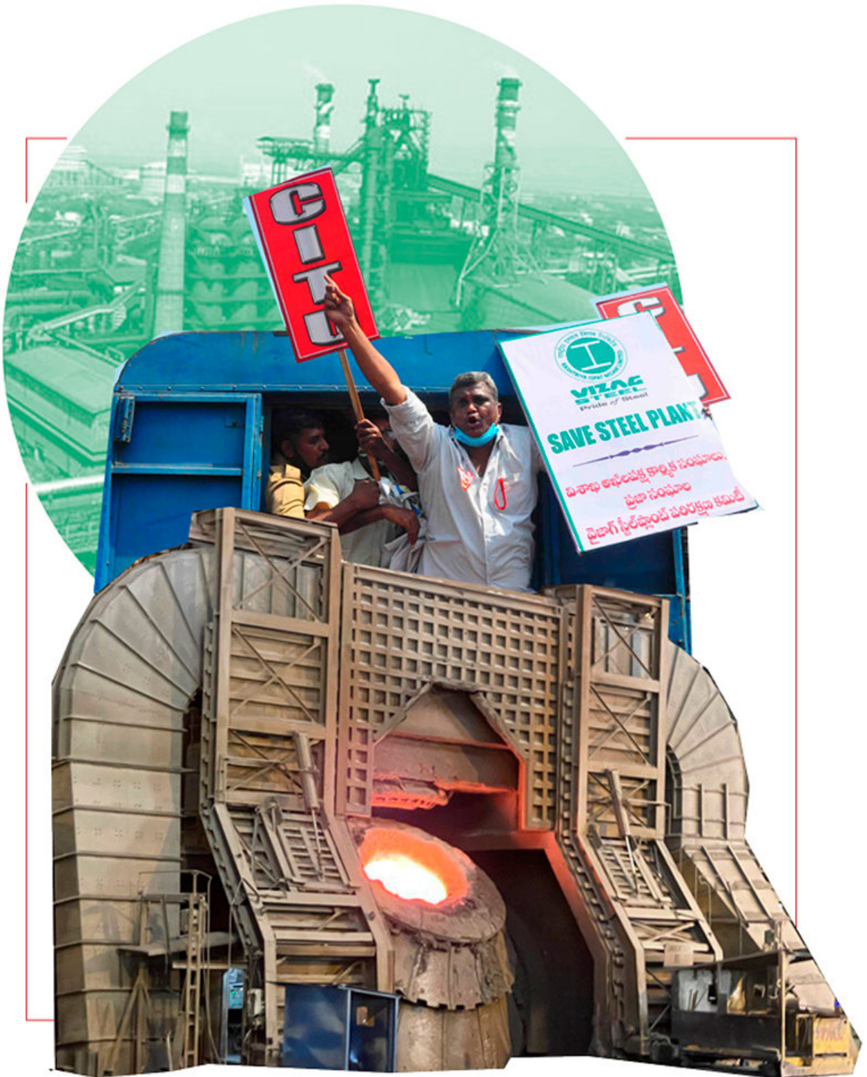
The inspirational story of Visakha Steel is the subject of our dossier no. 55 (August 2022), The People's Steel