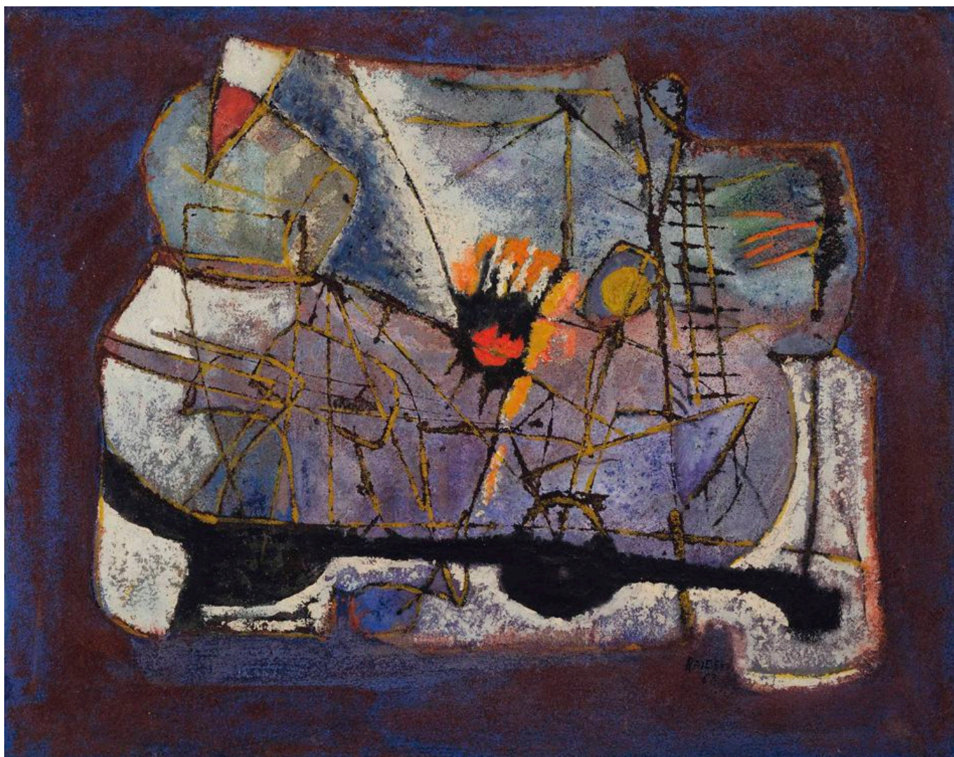
Aref El-Rayyes (Lebanon), Untitled , 1963.

Not only has Israel begun to bomb Rafah, but it hastily sent in tanks to seize the only border crossing through which aid dribbled in on the few trucks a day that were allowed to enter. After Israel seized the Rafah border, it prevented the entry of aid into Gaza altogether. Starving Palestinians has long been Israeli policy , which is of course a war crime. Preventing aid from entering Gaza is part of the international division of humanity that has defined not only this genocide, but the occupation of Palestinian land in East Jerusalem, Gaza, and the West Bank since 1967 and the system of apartheid within the borders defined by Israel following the 1948 Nakba ('Catastrophe').