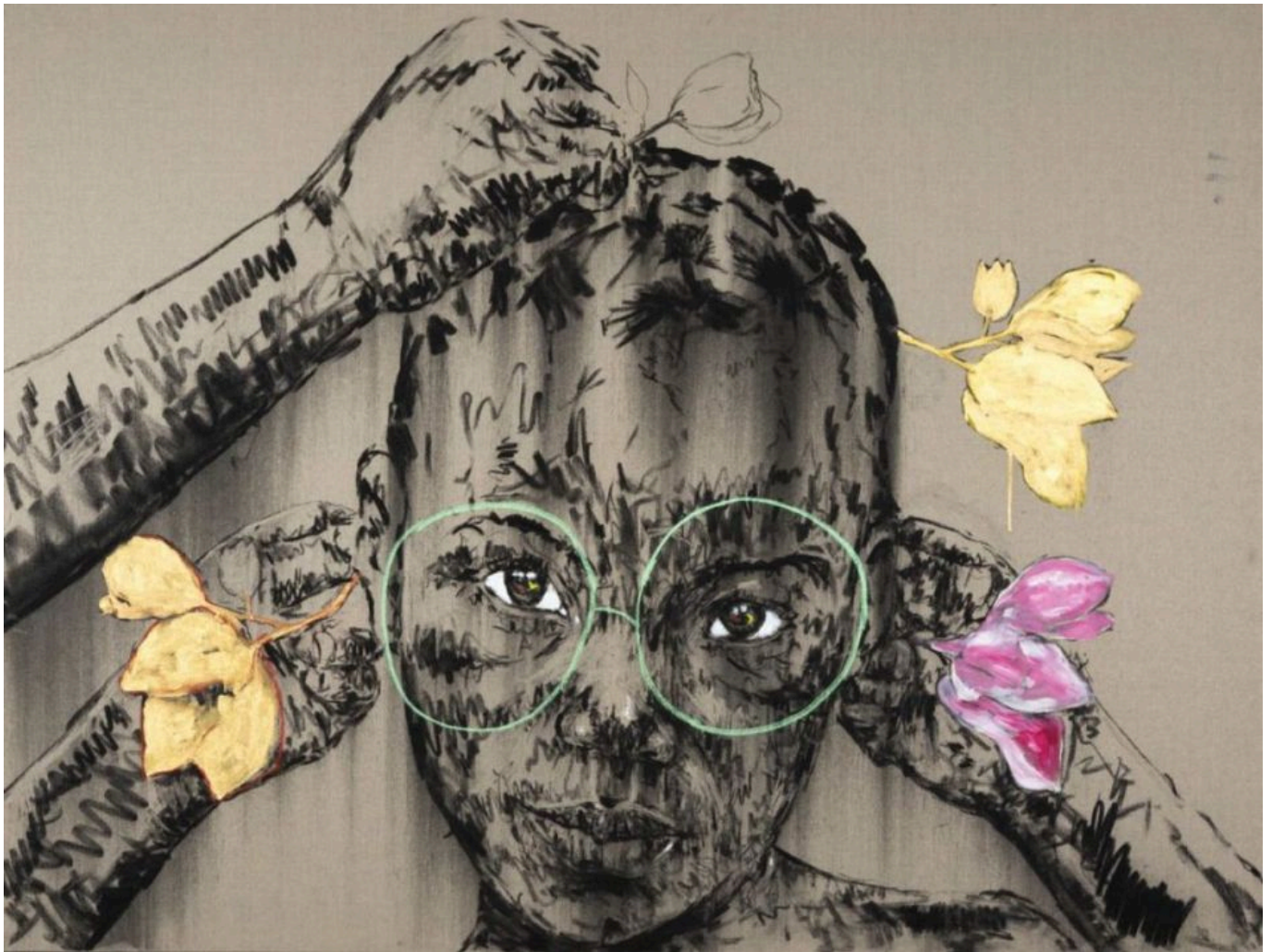
Nelson Makamo (South Africa), Decoration of the Youth , 2019.

Apartheid. The Israeli government treats the Palestinian minority population within the borders defined in 1948 (21%) as second-class citizens. There are at least sixty-five Israeli laws that discriminate against Palestinian citizens of Israel. One of them, passed in 2018, declares the country a ‘nation state of the Jewish people’. As the Israeli philosopher Omri Boehm wrote , through this new law, the Israeli government ‘formally endorses’ the use of ‘apartheid methods within Israel’s recognised borders’. The United Nations and Human Rights Watch have both said that Israel’s treatment of Palestinians falls under the definition of apartheid. The use of this term is entirely factual.