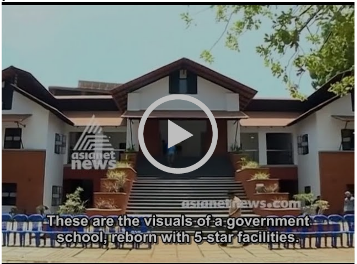
Karaparamba - The Transformation of a Government School in Kerala

The picture above provides an example of what the Left government has done in Kerala. It is of the Government Higher Secondary School, Karaparamba in Kozhikode. While government schools across the world face a virtual embargo of funds and care, the schools in Kerala have been revamped. This 112-year-old school, which had thousands of students twelve years ago, had an enrolment that declined to 90 largely because of the neglect to the government schools across India.