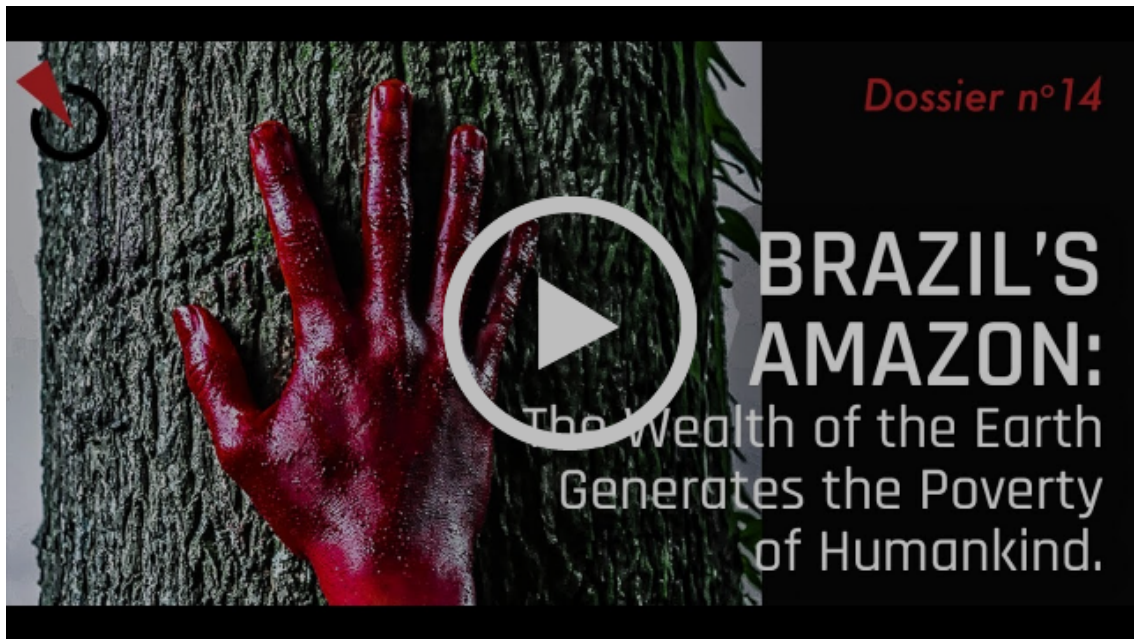
Dossier no. 14: Brazil's Amazon (a short video).

The fight over the Amazon is not new, but the scale of its potential destruction has considerably increased. As the team writes in the dossier, 'The instruments of this devastation are several: deforestation, logging and illegal burning of the forest, the disorderly expansion of livestock, roads and soybean cultivation as well as the implementation of large mineral and energy projects.' The protagonists of the murder of the Amazon are clear: capitalist firms of different scales and the political class that enables them. At the frontline of the destruction are the 170 indigenous communities who have lived in the Amazon for the past 11,000 years.