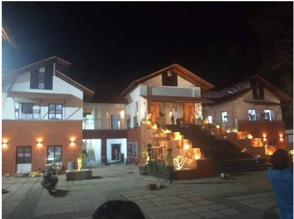
Government Higher Secondary School, Karaparamba in Kozhikode, Kerala.

At the other end of the planet, in the Chagos Archipelago, the Chagossians continue to fight against the UK government to regain their sixty islands stolen from them decades ago. On the largest of these islands – Diego Garcia – sits a US military base. The International Court of Justice recently asked the UK to give the Chagossians their islands, but the UK has rejected the verdict as merely 'advisory' (please read my column here ). Chagos, like the Amazon, is the gate of Madrid. The sentry stands guard, but the army in front is formidable. Hope seems to be vanquished at each turn. And yet.