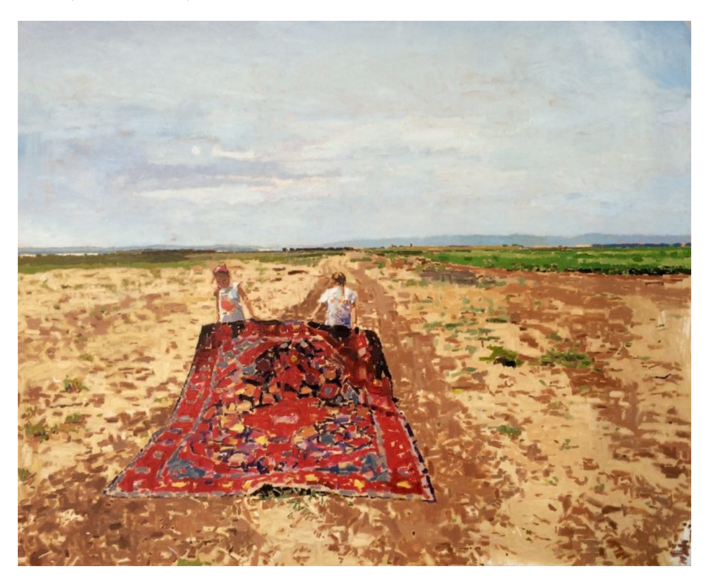
Fatma Shanan (Palestine), Two Girls Holding a Carpet, 2015.

West Bank, been gradually squeezed by illegal settlements, the apartheid wall, checkpoints, and regular attacks by the Israeli military.