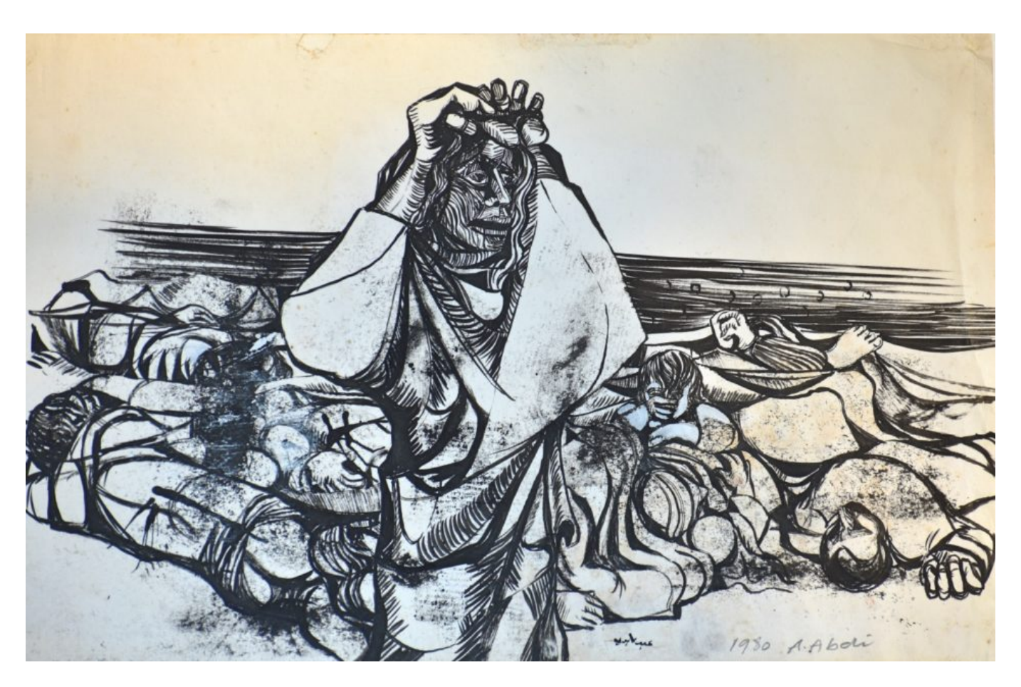
Abed Abdi (Palestine), Massacre in Lydda, 1980.

Kushner's choice of the Negev, or al-Naqab in Arabic, is interesting. Al-Naqab, located in what is now southern Israel, has long been a place of tension and conflict. In September 2011, the Israeli government passed the Bill on the Arrangement of Bedouin Settlement in the Negev, also known as the Prawer-Begin Plan, which called for the eviction of 70,000 Palestinian Bedouins from their thirty-five 'unrecognised' villages. Kushner is now advising Israel to illegally shift even more Palestinians to al-Naqab, many of whom were originally pushed to Gaza from cities in parts of Palestine that are now within Israel. As Kushner might know, both a population transfer to al-Naqab and the seizure of Gaza are illegal according to Article 49 of the 1949 Geneva Conventions.