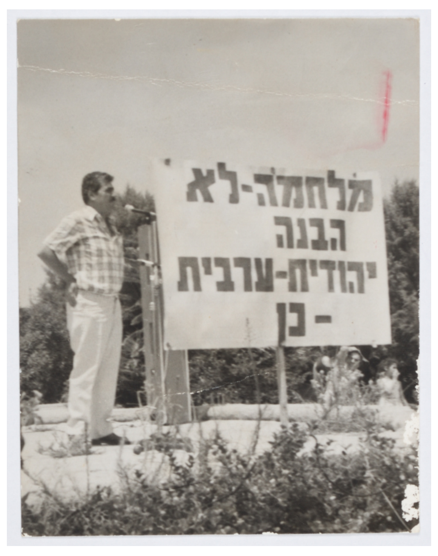
Tawfiq Zayyad in Jaffa in 1974.