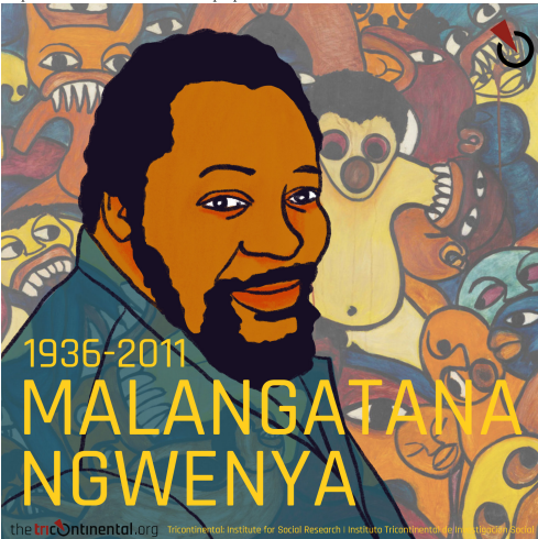
Malangatana Ngwenya, 1936-2011.