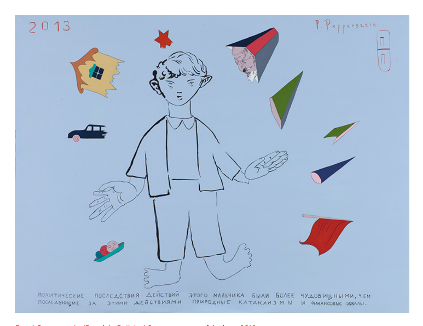
Pavel Pepperstein (Russia), Political Consequences of Actions, 2013.

between Europe and Asia (including Russia and Turkey) – would provide major advantages to European society, but is instead sacrificed to the interests of the United States.