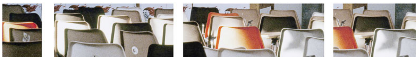
Organisers prepare for the first session of the Culture and Resistance Symposium and Festival of the Arts in Gaborone, Botswana, 1982.