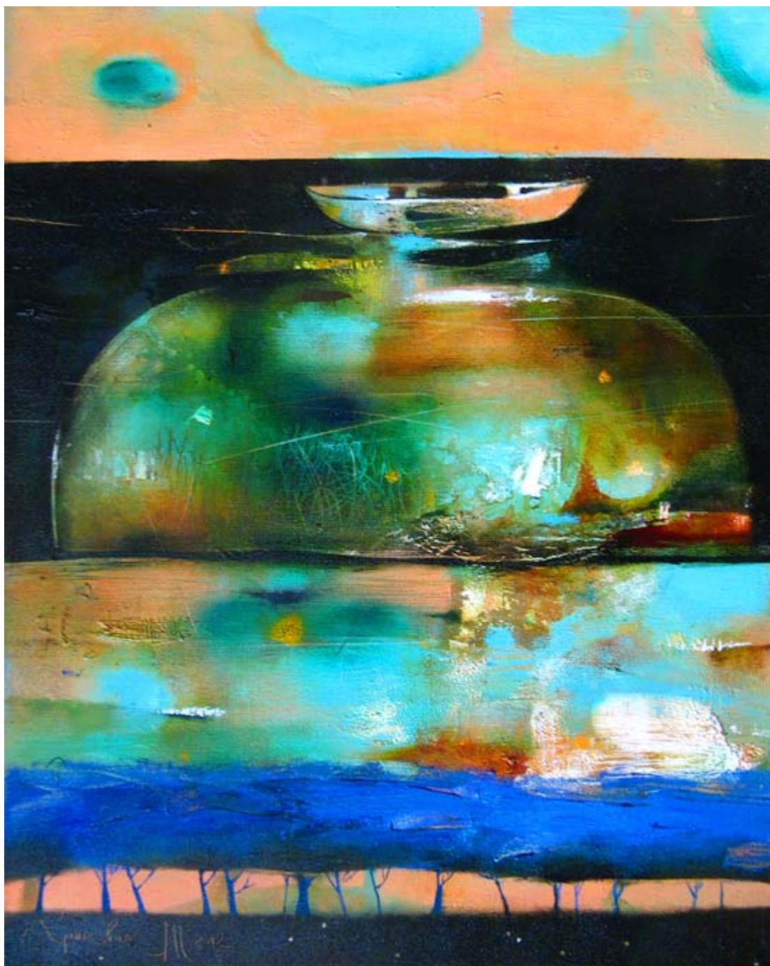
Tatiana Grinevich (Belarus), The River of Wishes , 2012.