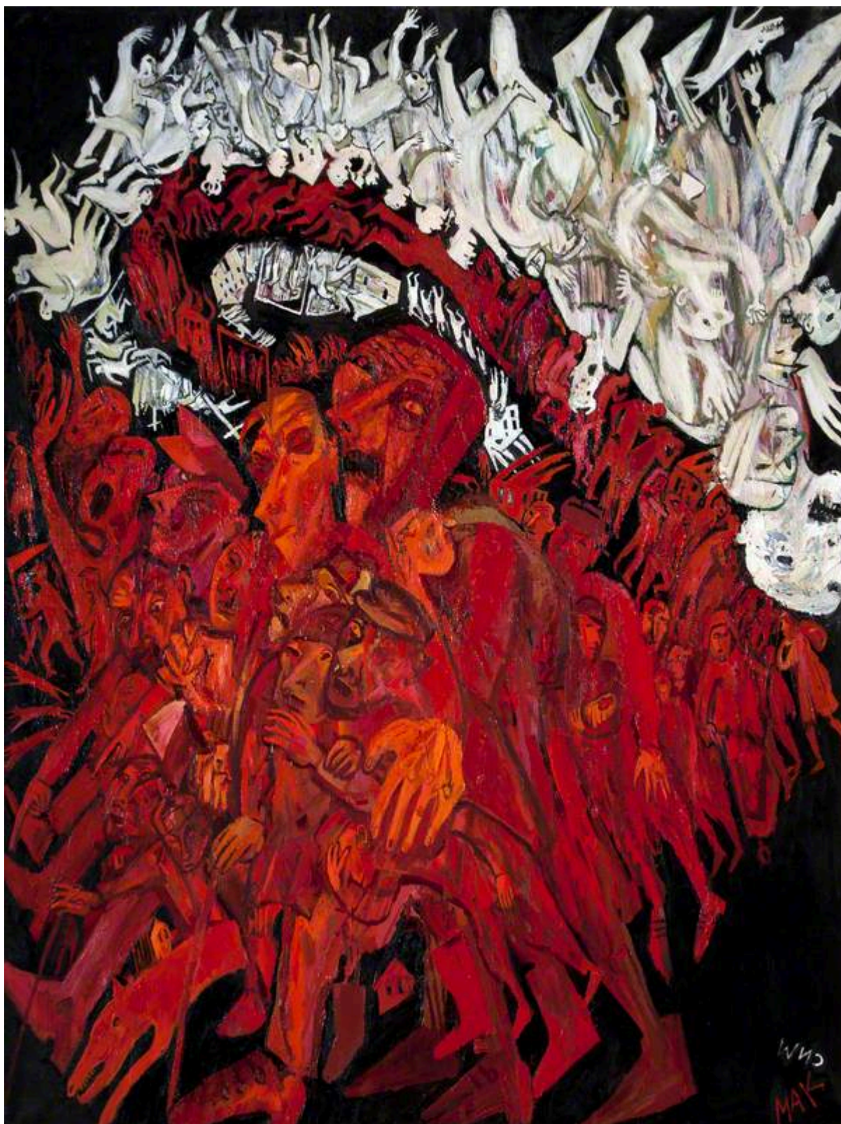
Maxim Kantor (Russia), Two Versions of History , 1993.

Briefing no. 14, a clear assessment of current dangers around the escalation in and around Ukraine, underscores the need, as Abdullah El Harif of the Workers' Democratic Way party in Morocco and I wrote