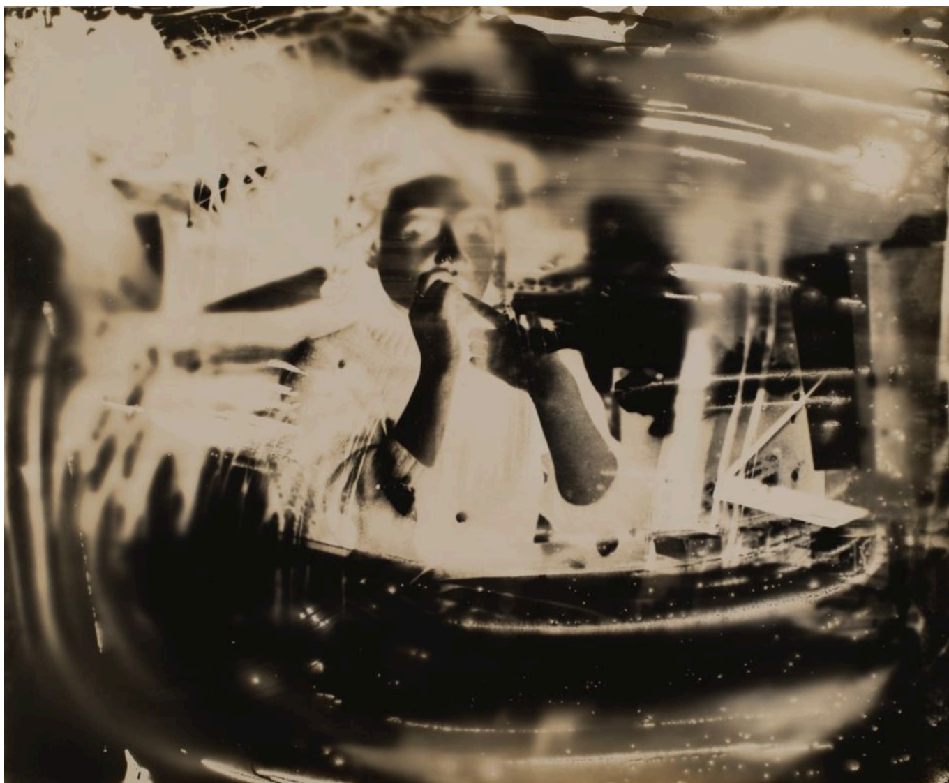
Shigeru Onishi (Japan), Flickering Aspect , 1950s.