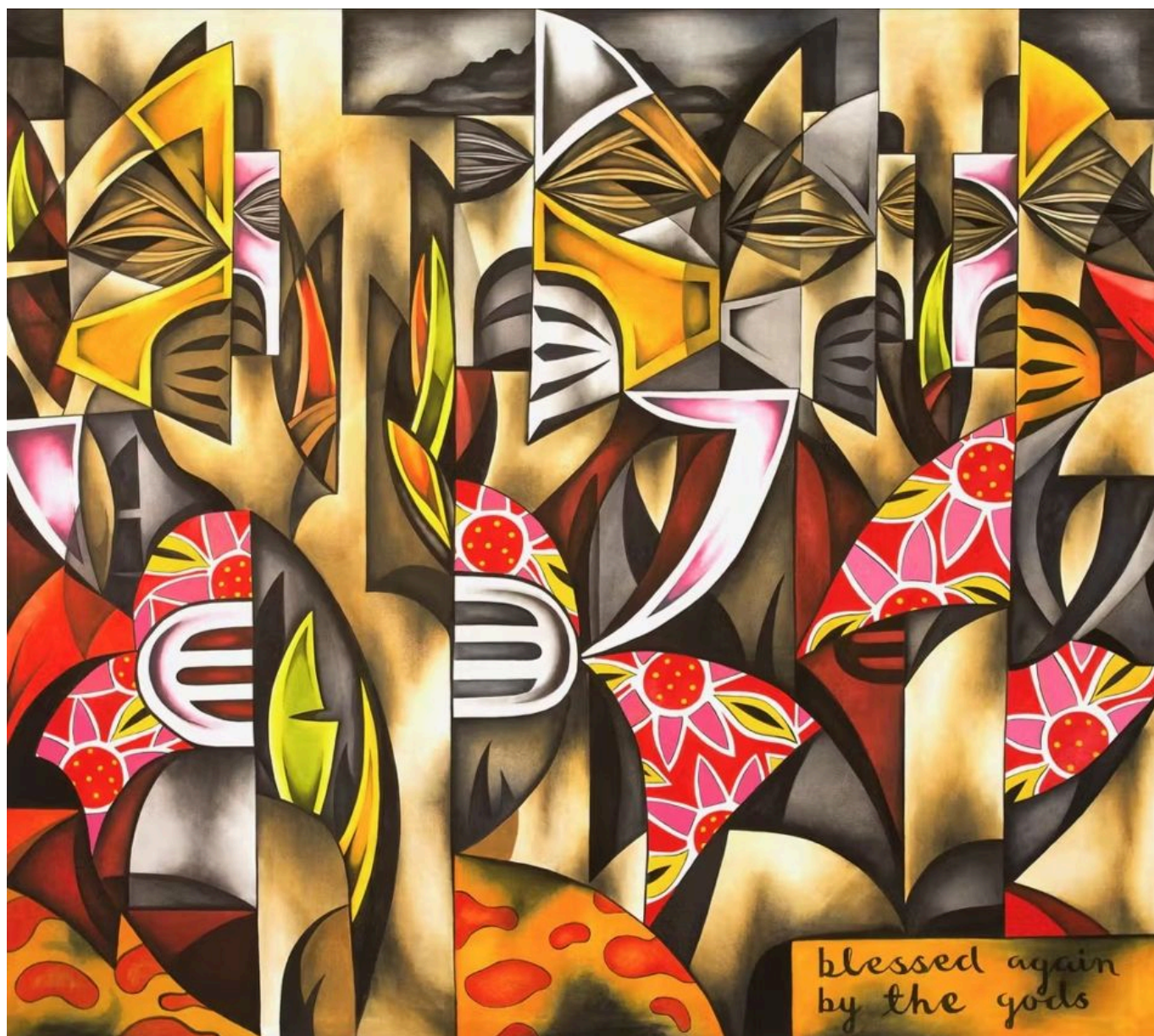
Mahiriki Tangaroa (Kūki 'Airani), Blessed Again by the Gods (Spring) , 2015.