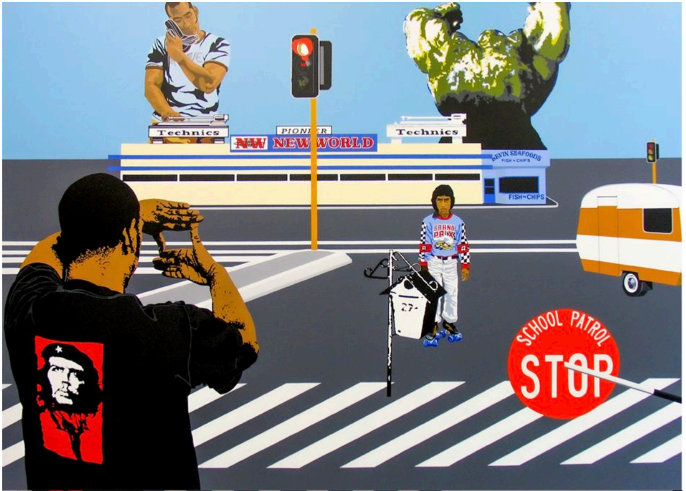
Kelcy Taratoa (Aotearoa), Episode 0010 from the series Who Am I? Episodes , 2004.