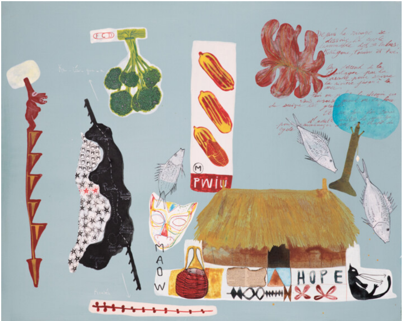
Stéphane Foucaud (New Caledonia), MAOW! (2023).

In 1985, thirteen countries of the south Pacific signed the Treaty of Rarotonga , which established a nuclear-free zone from the east coast of Australia to the west coast of South America. As French colonies, neither New Caledonia nor French Polynesia signed it, but others did, including the Solomon Islands and Kūki 'Airani (Cook Islands). Gorodé is now dead, and US nuclear weapons are poised to enter northern Australia in violation of the treaty. But the struggle does not die away.