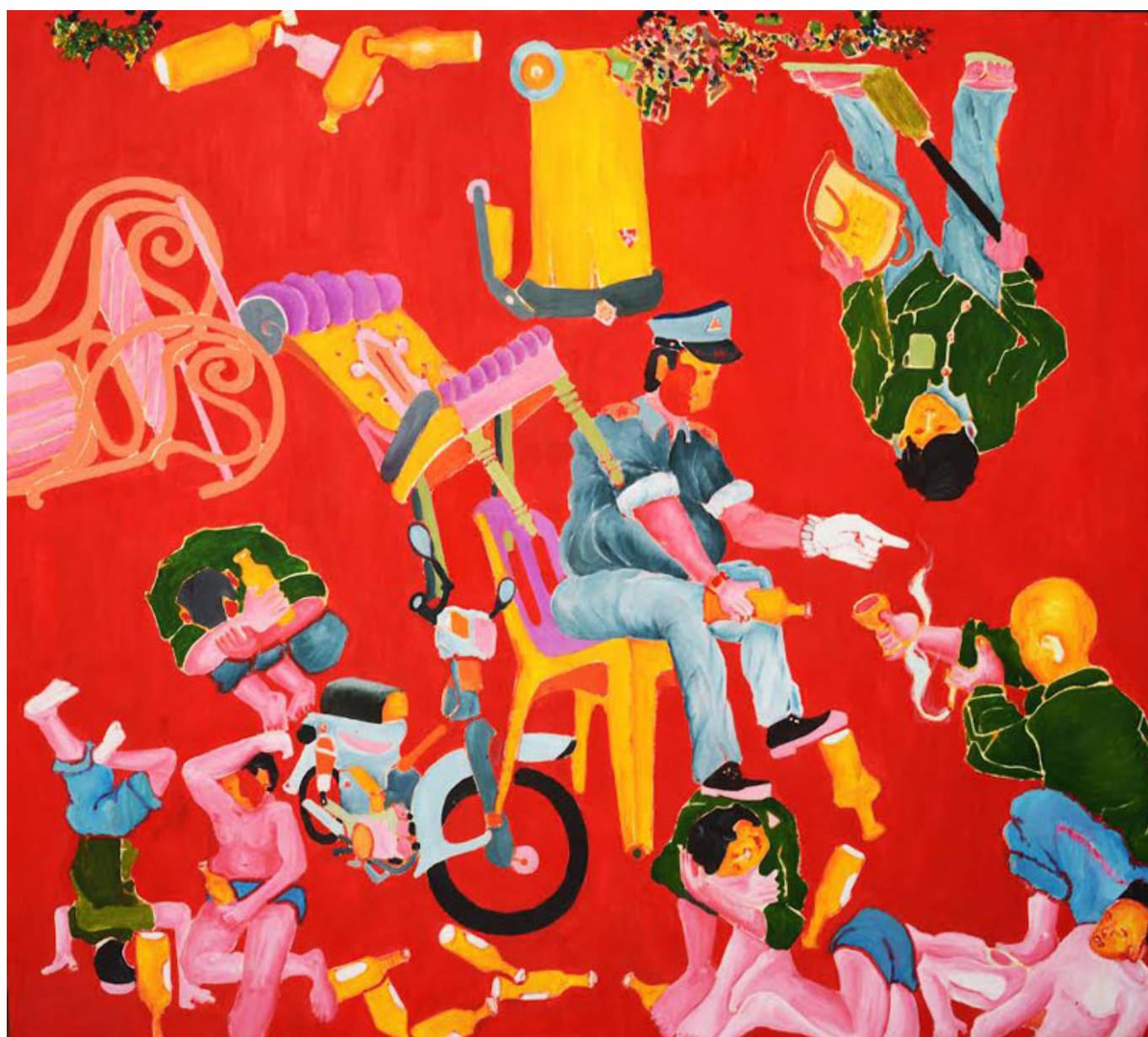
Meas Sokhorn (Cambodia), Inverted Sewer , 2014.