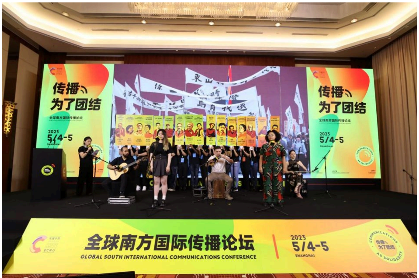
Opening cultural performance of the Global South International Communication Forum, 4 May 2023.

However, in recent years, this dream of the free flow of information has been revived by movements of the Global South, which have been frustrated by the near-total absence of their views in international debates and by the imposition of a narrow, foreign worldview on their countries about the dilemmas that they face (war and hunger, for instance). As part of this revival, hundreds of editors and journalists from the Global South gathered in Shanghai (China) in early May for the Global South International Communication Forum. At the close of two days of intense debate, the participants drafted and voted on a Shanghai Consensus, which can be read in full below.