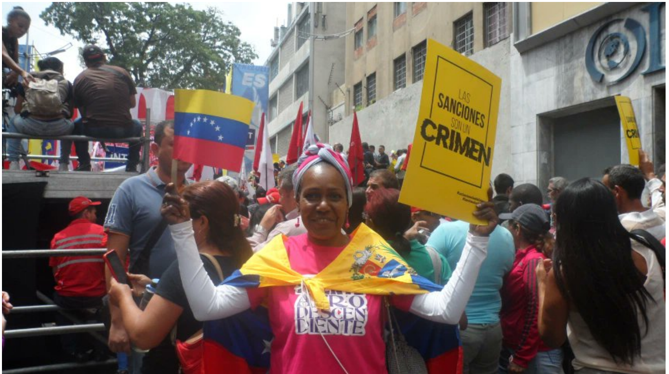
Sanctions are a crime, Caracas, Venezuela, 2020.