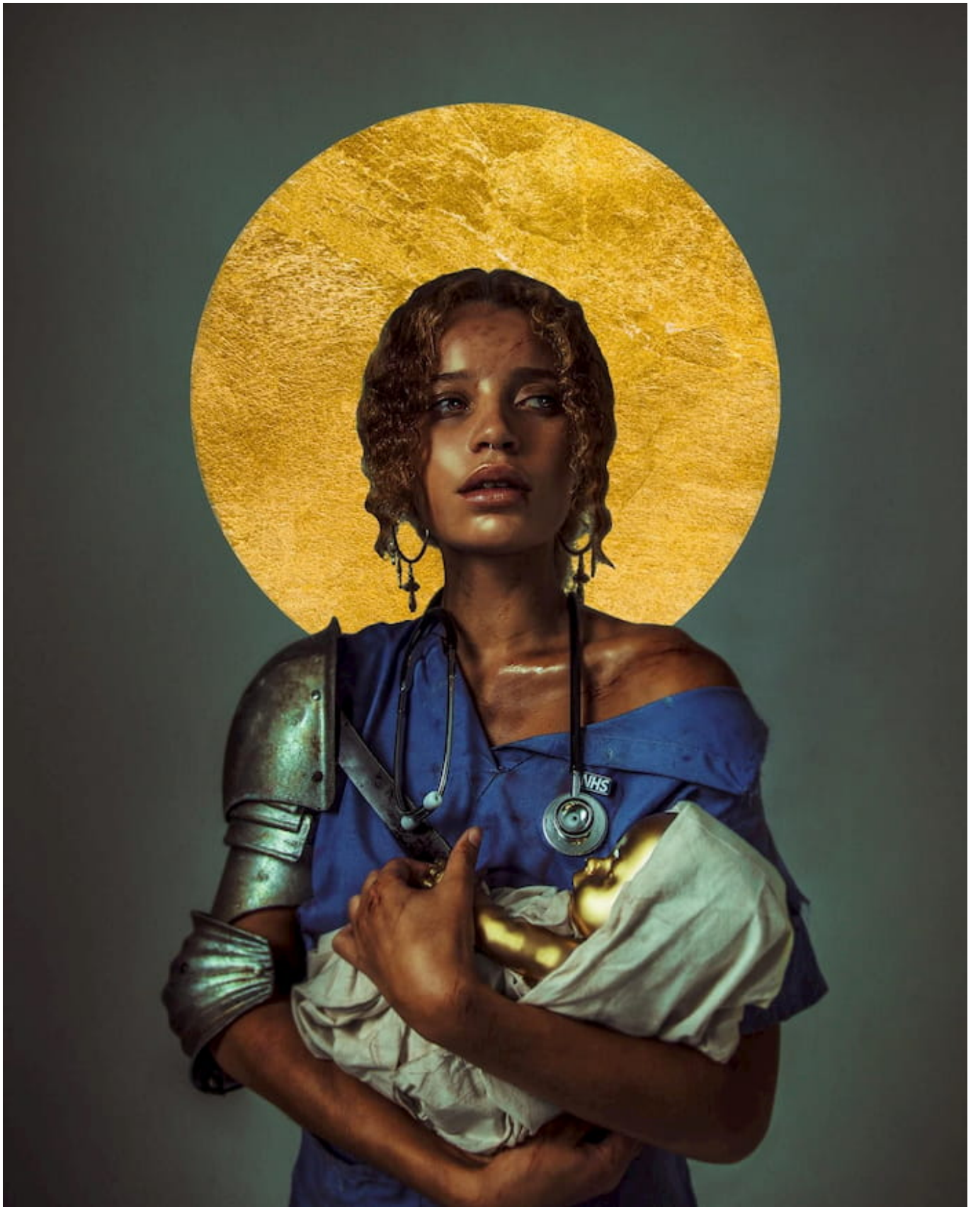
Haris Nukem, Counting Blessings , 2019.