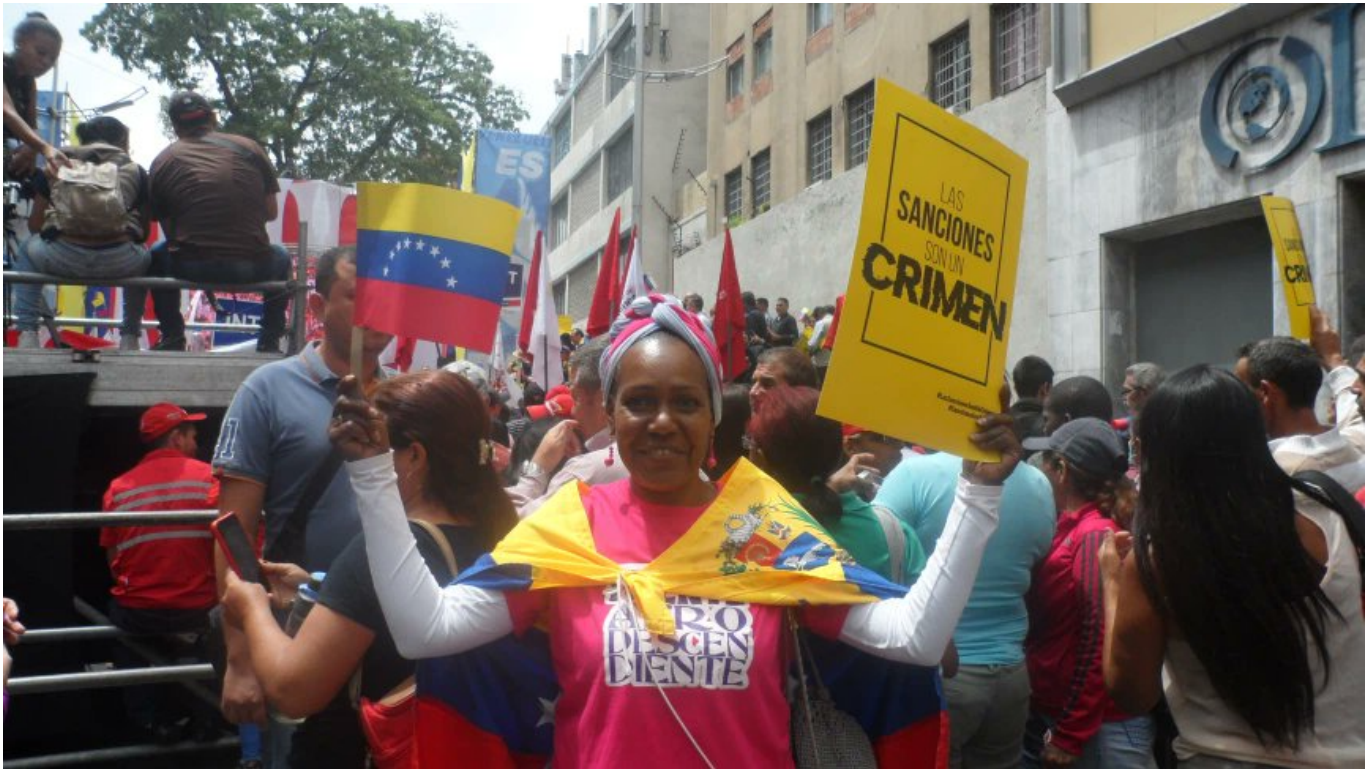
Sanctions are a crime, Caracas, Venezuela, 2020.