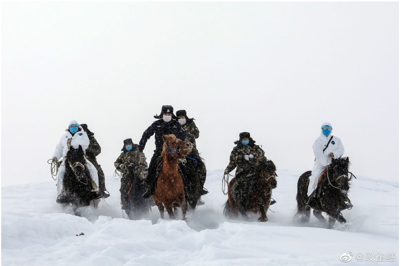
Chinese doctors in the Altai mountains.

Humans have for centuries confronted with great sorrow little understood cataclysmic death, plagues and cholera being the most notable. When the catastrophes strike, it is often women – as nurses, as mothers, and as sisters – who have held society together. Mysterious and mystical explanations have abounded. Science has helped us break through the deep fatalism that has bewildered people; now we seek explanations in the sequencing of genes and in the creation of vaccines. It is belief in reason, science, and solidarity that sent Chinese doctors and nurses to the ends of their country, such as into the Altai Mountains, to heal people and to contain this very dangerous virus that has engulfed us in anxiety and death; it is this that sent them, along with Cuban doctors, to Iran, Iraq, and Italy to assist countries in distress. Their arrival reminds us of a century-long history of socialist doctors and nurses who have thrown themselves into international solidarity for the sake of humanity. These are people who share an ethical landscape with the Indian communist doctors and their people’s polyclinics that we wrote about in Dossier no. 25 (February 2020). This is the socialist tradition.