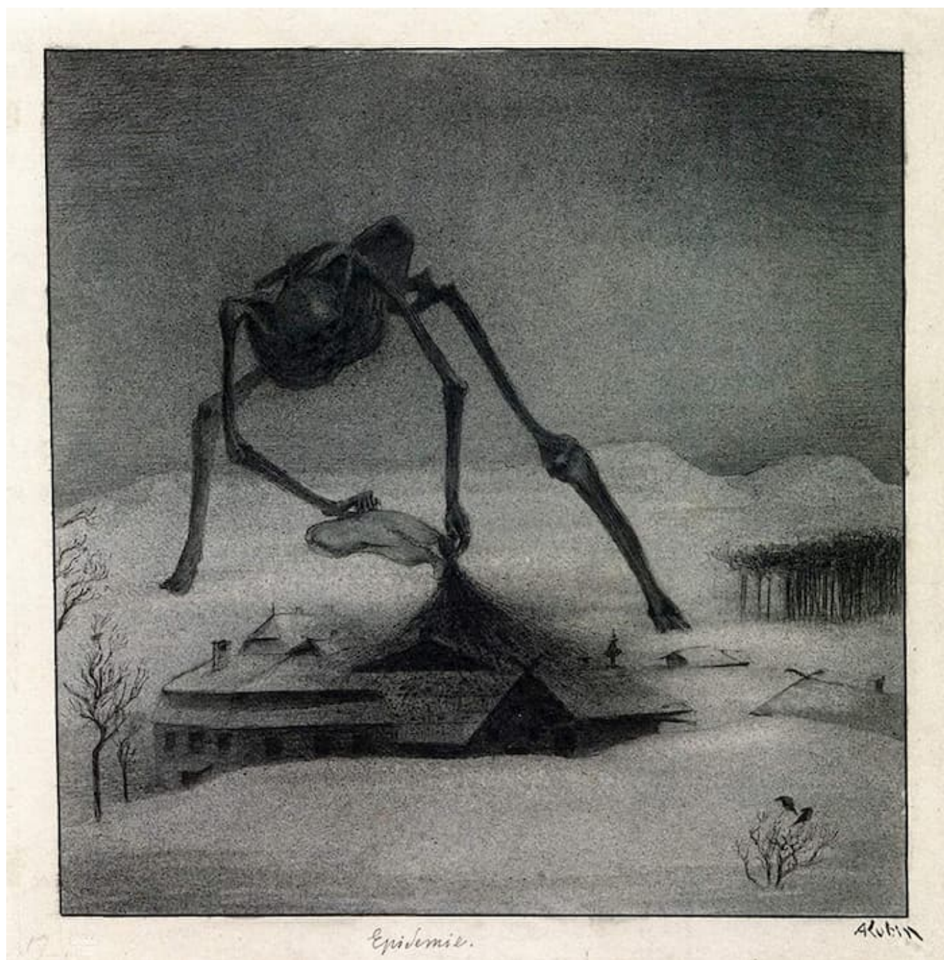
Alfred Kubin (Austria), Epidemic, 1900-1901 (Stadtische Galerie im Lenbachhaus Munich).