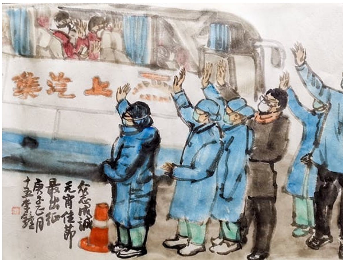
Li Zhong (China), Paintings for Wuhan, 2020 .

This is most clear in the health sector, where public health institutions have been underfunded, where medical care has been transferred to private corporations, and where private hospitals and clinics operate without any surge capacity. This means that there are simply not enough hospital beds or medical equipment (masks, ventilators, etc.) and that the nurses, doctors, paramedics, janitors, and others on the front line are forced to operate in conditions of acute scarcity, in many cases without basic protection. It is often the people who make the least who are putting the most at stake to save lives in the face of the rapidly spreading pandemic. When a global pandemic strikes, the private-sector austerity model simply falls apart.