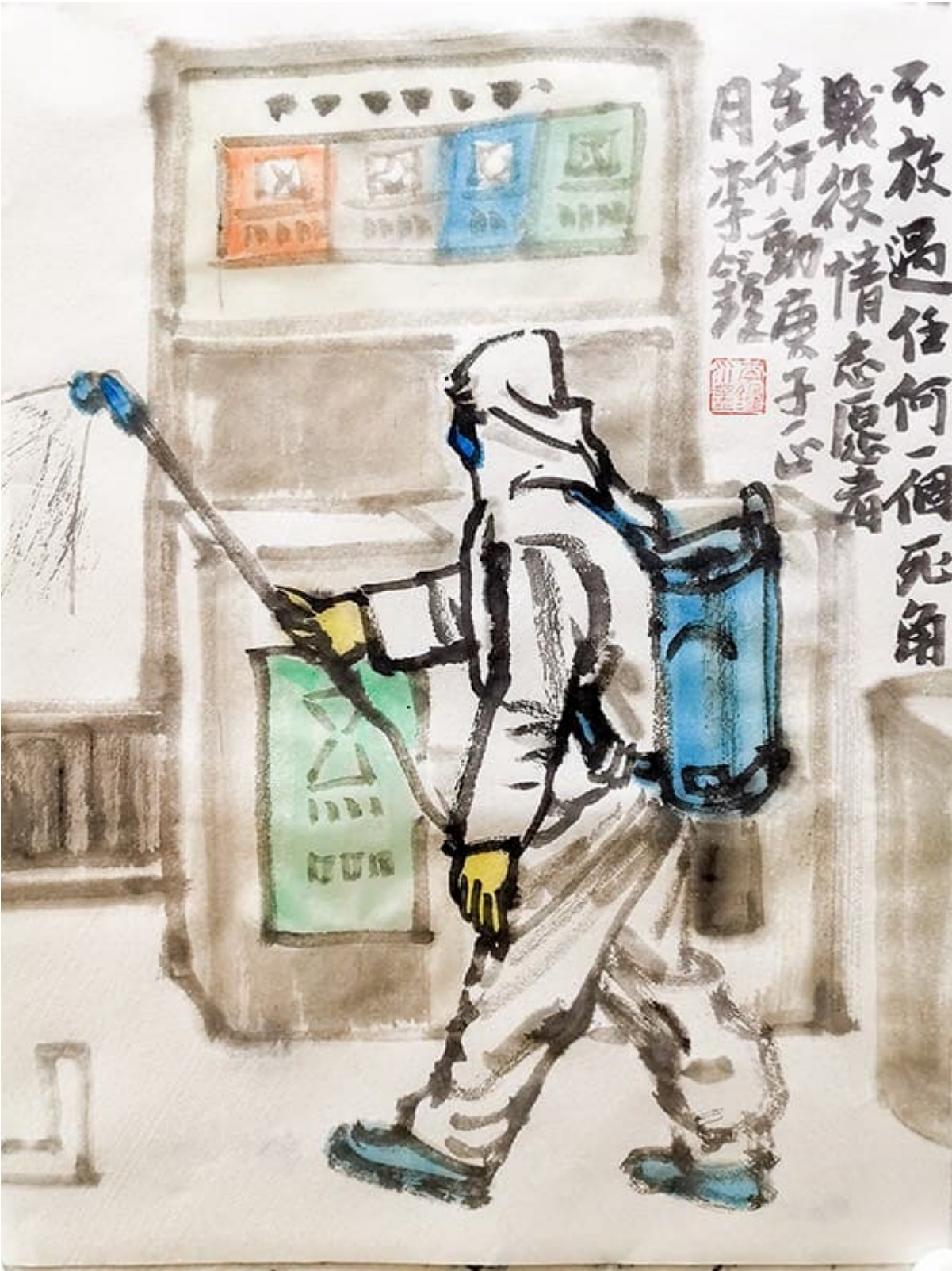
Li Zhong (China), Paintings for Wuhan, 2020.