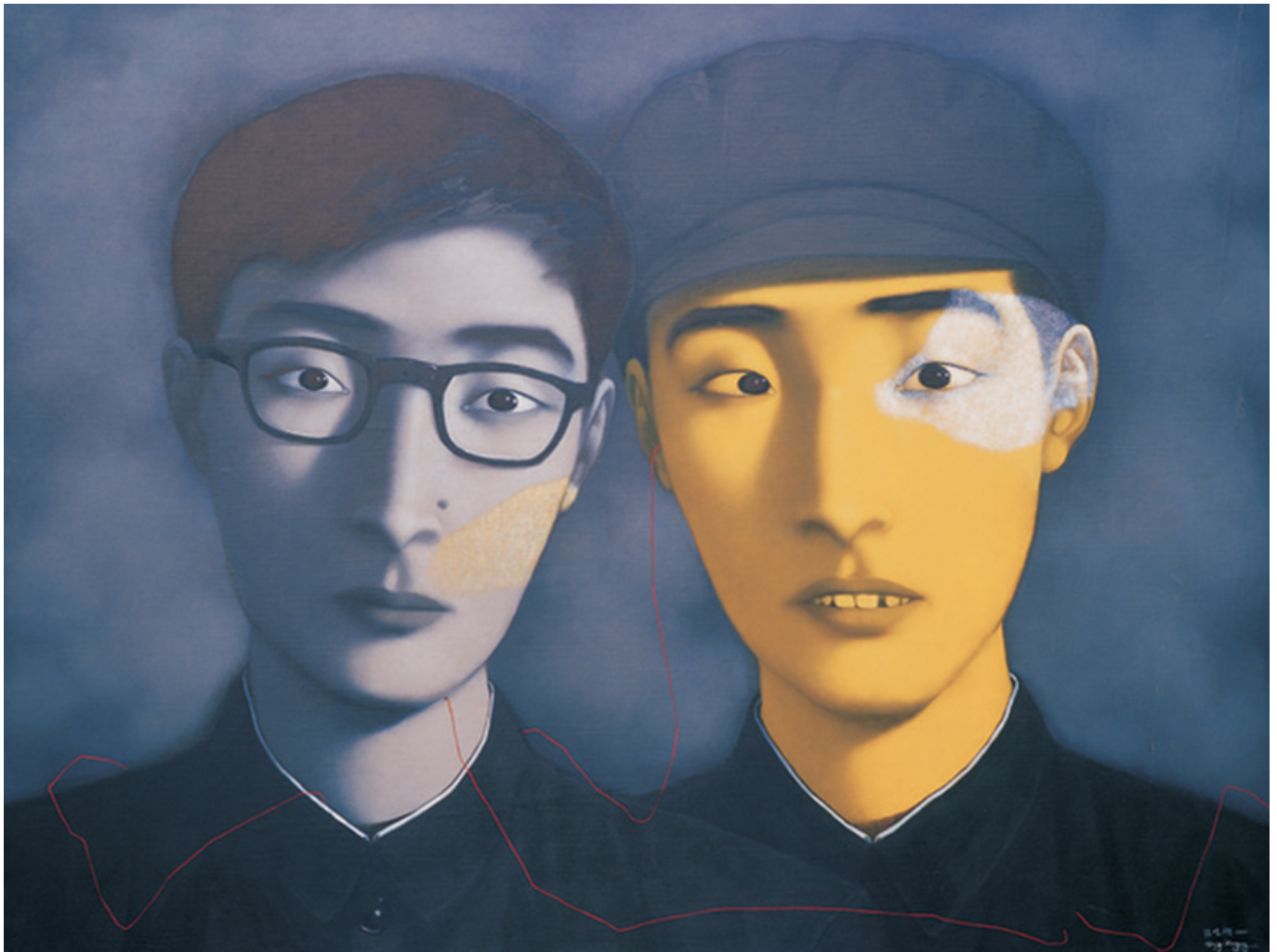
Zhang Xiaogang, Bloodline - Big Family no. 4, 1995.

The United States – which has the habit of dominance – tried its best to both manage and to prevent the growing global role of China. To manage China means to intimidate it to remain subordinate to US economic interests: Washington accused Beijing of currency manipulation and tried to get China to revise its currency to the benefit of the United States; this did not happen, and its failure to happen is a sign that China will not bow to US authority. Accusations about the currency were quickly followed by claims that China had forced technology transfers or had stolen intellectual property, that China prevented access to financial services, and that it would not cut its industrial subsidies. Each US President over the course of the past decade – George W. Bush, Barack Obama, and Donald Trump – has accelerated the accusations against China and portrayed China as having advanced entirely by deceit.