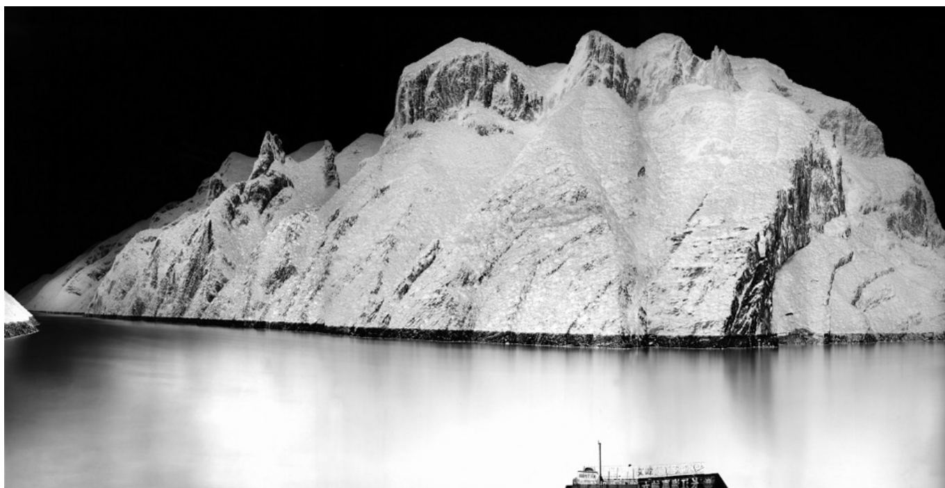
Shi Guorui, The Yangtze River , 2013.

In the Tricontinental: Institute for Social Research Dossier no. 24 – The World Oscillates Between Crises and Protests – there is an important section on the new ‘bipolar world’. It is widely recognised that US power has dwindled since the illegal attack on Iraq in 2003 and since the world financial crisis of 2007-08; at the same time, it is hard to deny the rapid growth of China’s economy and of China’s growing importance on the world stage. A decade ago, when China and Russia joined Brazil, India, and South Africa to form the BRICS, it appeared as if the global architecture was shifting from US unipolarity (with its allies as the spokes around the US hub) to multipolarity; but, with the deepening crisis in countries like Brazil and India, the new global architecture – according to Tsinghua University’s Institute for International Relations – will be one of bipolarity, with the US and China as the two poles of the global order.