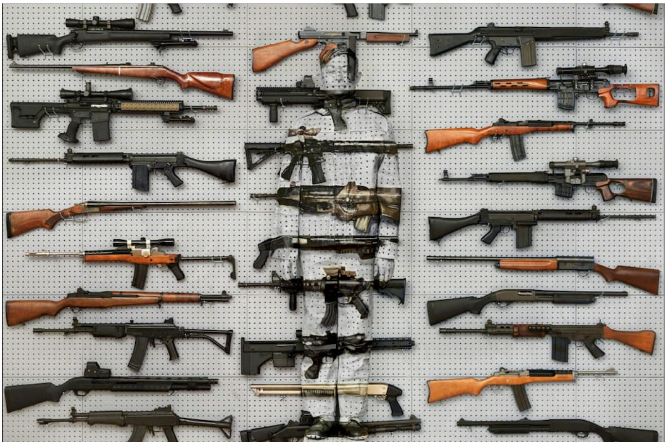
Liu Bolin, Hiding in New York No. 9 - Gun Rack, 2013.