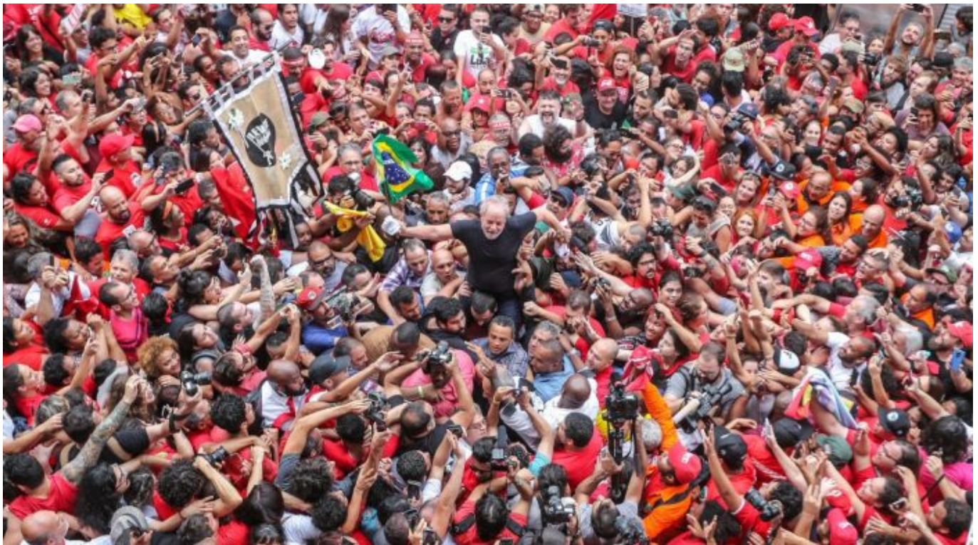
Lula on the streets of São Paulo, November 2019.

Bolivia might have been erased from the maps, but it remained a major source of silver and tin for transnational firms from Europe and the United States of America. It continues to remain a major source of tin and today it is home to up to 70% of the world’s lithium supply. The demand for lithium – used for batteries for electric cars and electronic devices such as cell phones – is expected to more than double by 2025. Morales’s government set high standards for its mining partnerships: it demanded that at least half of the control of the mines remain with Bolivia’s national mining firms, and that the profit from the mines be used for social development. Transnational firms sued Bolivia for breaking its contracts and rejected the new standard set by the Morales government. The only firms that agreed to the Bolivian position came from China. As Morales’s government cut deals with Chinese firms, this aggravated not only the transnational firms but also their governments (the United States, Canada, and the European Union). One aspect of the coup is for these companies to gain control of Bolivia’s natural resources – notably lithium, which is essential to electric cars.