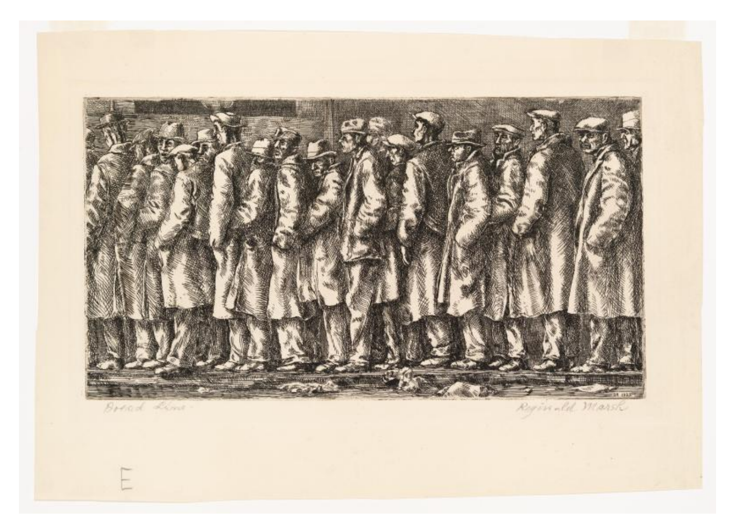
Reginald Marsh, Bread Line – No One Has Starved, 1932.

appropriation of social wealth by the bourgeoisie, the State is forced by the people to create social welfare programmes – public health and public schools, as well as targeted schemes for the indigent and the working poor. If these are not available people will begin to die – in larger numbers – on the streets, which would call into question the swindle of fulfilment. But, as a consequence of the long-term crisis of profitability, these schemes have been cut over the past several decades. The outcome of this crisis of liberal democracy due to the neoliberal policy of austerity is high economic insecurity and growing anger at the system. A crisis of profitability becomes a crisis of political legitimacy.