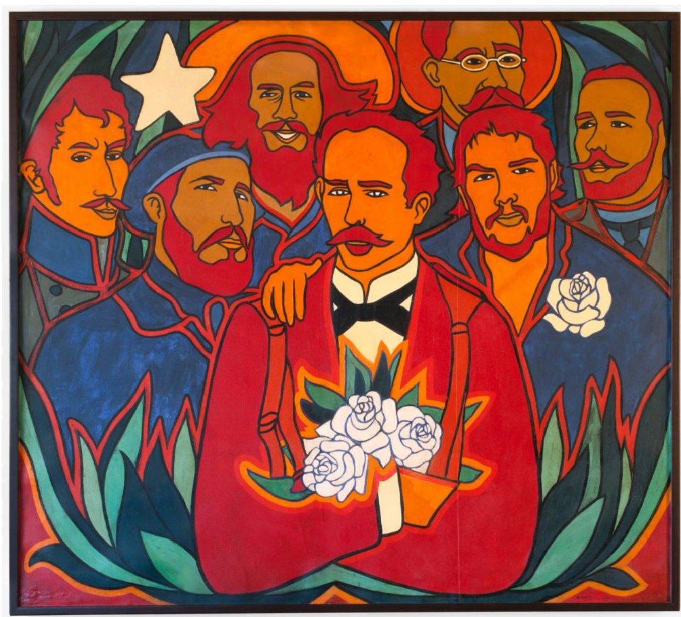
Raúl Martínez, Rosas y Estrellas (Roses and Stars), 1972.