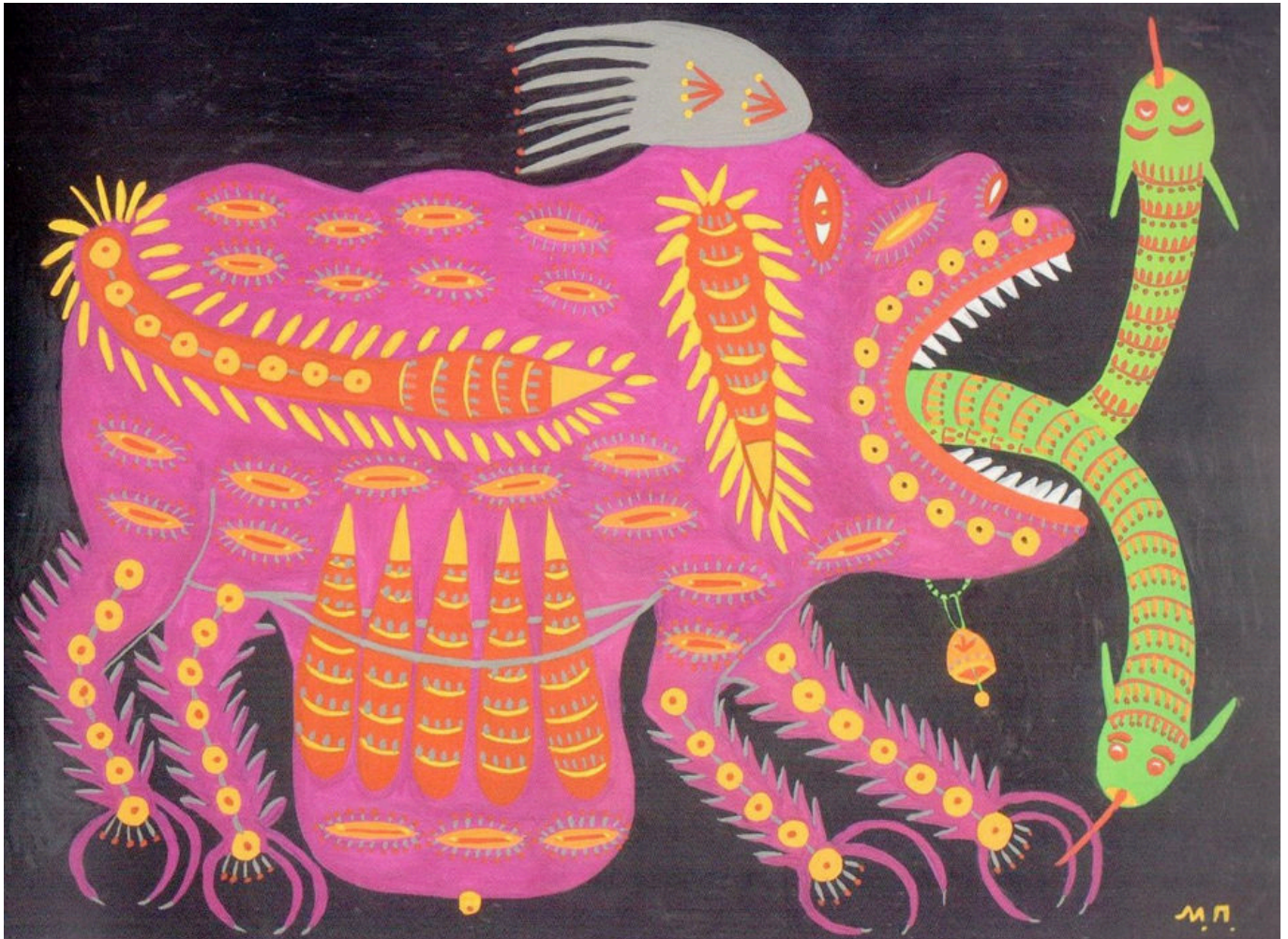
Maria Prymachenko (Ukraine), May That Nuclear War Be Cursed! , 1978.

There is a practical method to take the global desire for the abolition of nuclear weapons forward: the expansion of the Nuclear-Weapons-Free Zones (NWFZ).