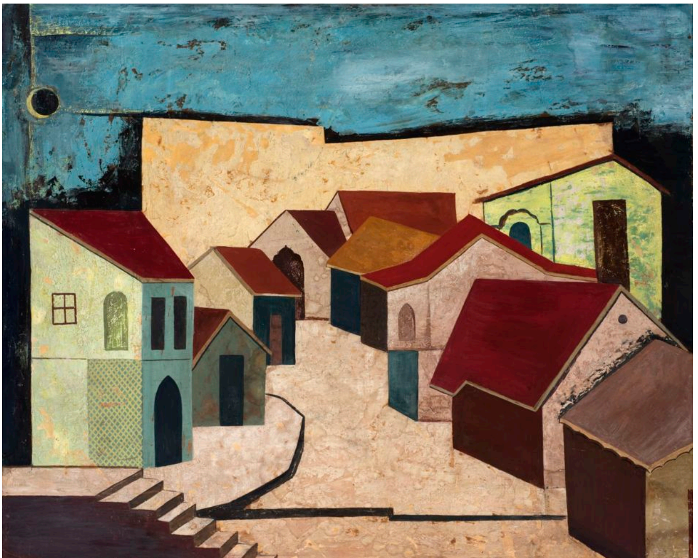
Ali Imam (Pakistan), Untitled (Deserted Town with a Black Sun) , 1956.