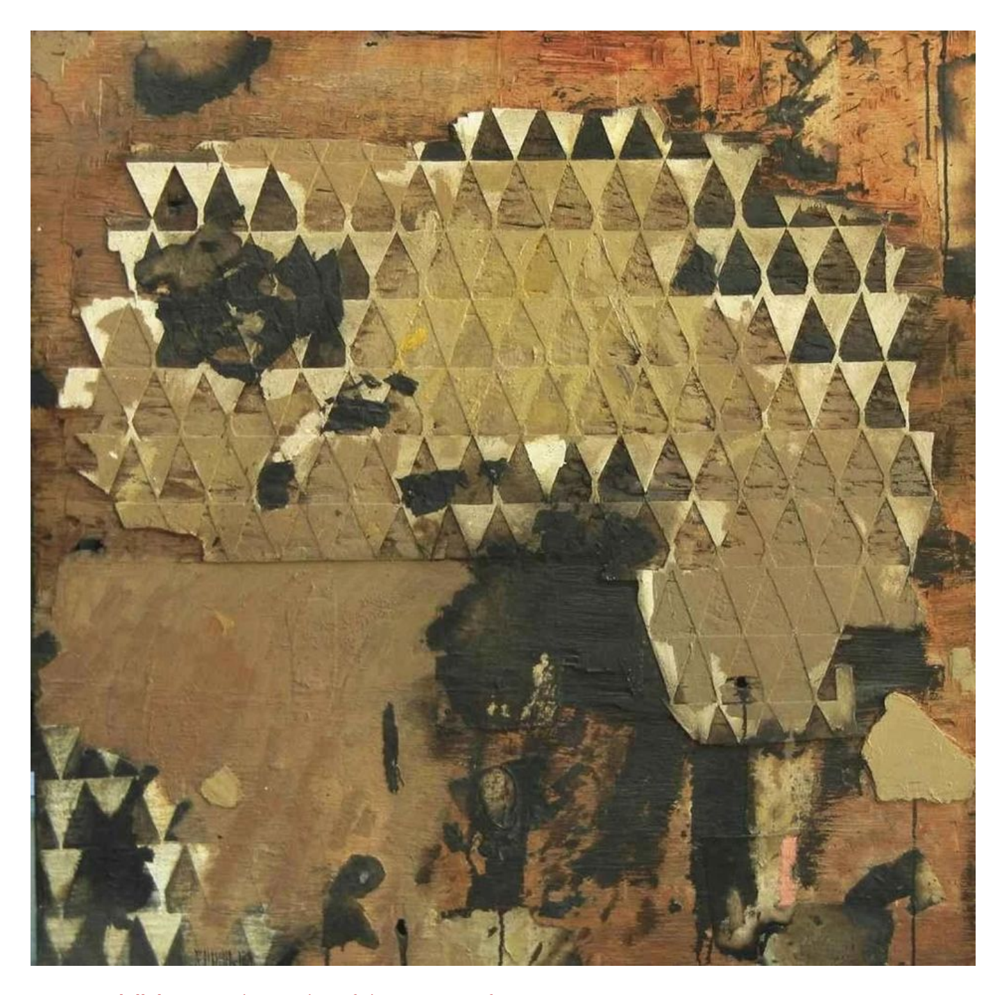
Hanaa Malallah (Iraq), The Looting of the Museum of Art , 2003.

As the numbers of the dead and displaced increase, a sense of numbness grows. It began with a hundred dead, then a hundred more, and is rapidly escalating into the tens of thousands. In Iraq, approximately a million people were killed by the US onslaught, the sheer scale of death and the anonymity surrounding it forcing a sense distance from the rest of the world. It is difficult to wrap one's head around these numbers unless there are stories attached to each of the dead and displaced.