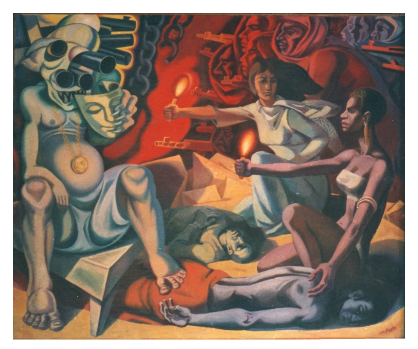
Mahoud Ahmad (Iraq), Title Not Known (Ahmad 9), 1976.

The statement about arms merchants is not made idly. According to a December 2024 fact sheet from the Stockholm International Peace Research Institute (SIPRI), the world's top 100 largest arms-producing and military services companies increased their combined arms revenues by 4.2% in 2023, reaching a staggering $632 billion. Five US-based companies accounted for nearly a third of these revenues. These 100 companies increased their total arms revenues by 19% between 2015 and 2023. Though the full numbers for 2024 are not yet available, if one looks at the quarterly filings from the main merchants of death, their earnings have spiked even further. Billions for warmongers, but nothing for children who are born into warzones.