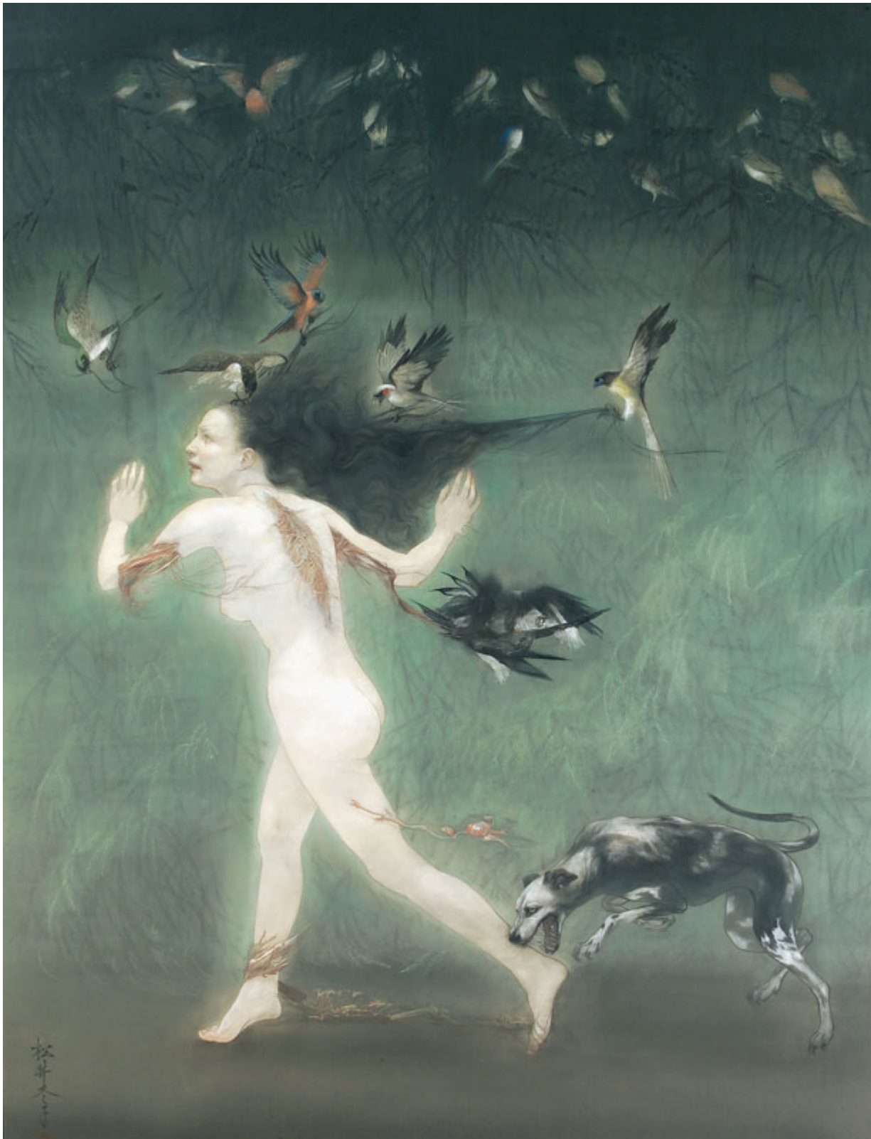
Fuyuko Matsui (Japan), Scattered Deformities in the End , 2007.

The veto has been used in the UN Security Council nearly 300 times. Since 1970, the US has used this power more than any of the other permanent members (China, France, Russia, and the United Kingdom). Many of