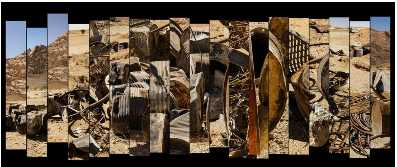
Ammar Bouras (Algeria), 24^{\circ}3'55''N 5^{\circ}3'23''E #2, 2012.