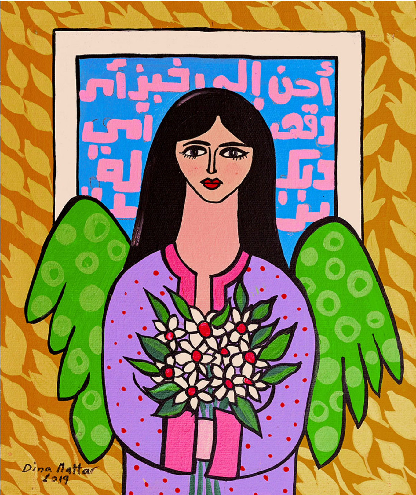
Dina Mattar (Palestine), Untitled 1 , 2019.