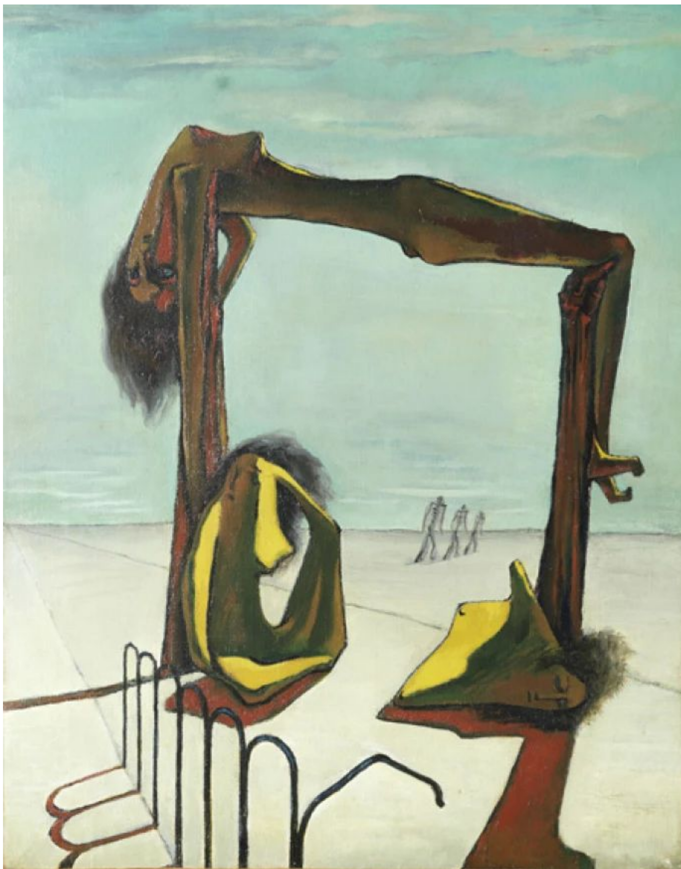
Ramses Younane (Egypt), Untitled , 1939.