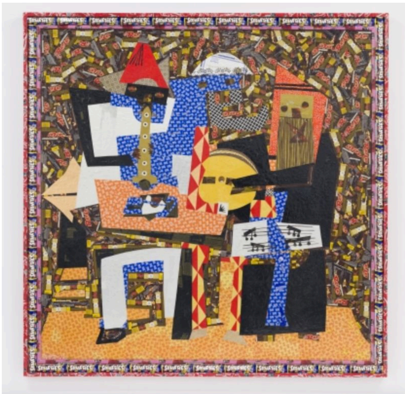
Ghada Al Rabea (Saudi Arabia), Al-Sahbajiea ('Friendship'), 2016.

The petrodollar system received two serious sequential blows.