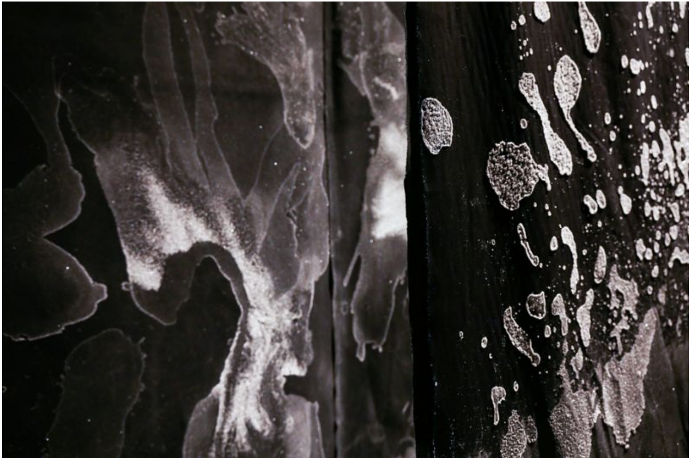
Balqis Al Rashed (Saudi Arabia), Cities of Salt , 2017.