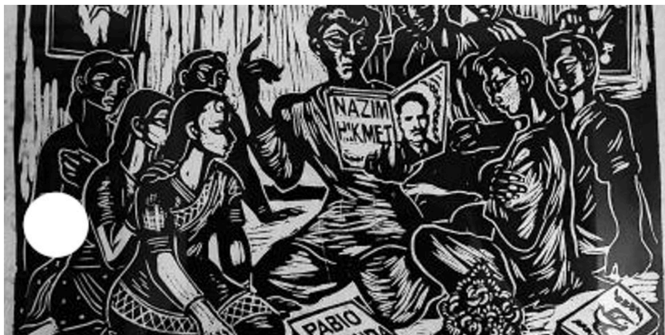
Chittaprosad, Indian Workers Read , n.d.