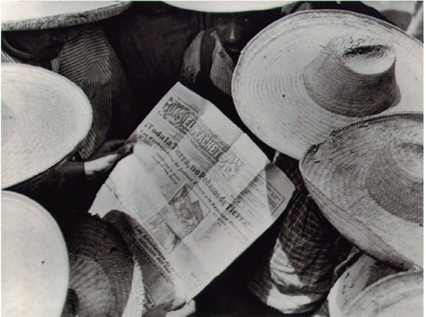
Tina Modotti, El Machete , 1926.

A Plan to Save the Planet is rooted in the principles of the United Nations Charter (1945), the document with the highest level of consensus in the world (193 member states of the UN have signed this binding treaty). We hope that you will read the plan and the dossier carefully. They have been produced for discussion and debate and are to be argued with and elaborated on. If you have any suggestions or ideas or would like to let us know how you were able to use the plan, please write to us at plan@thetricontinental.org .