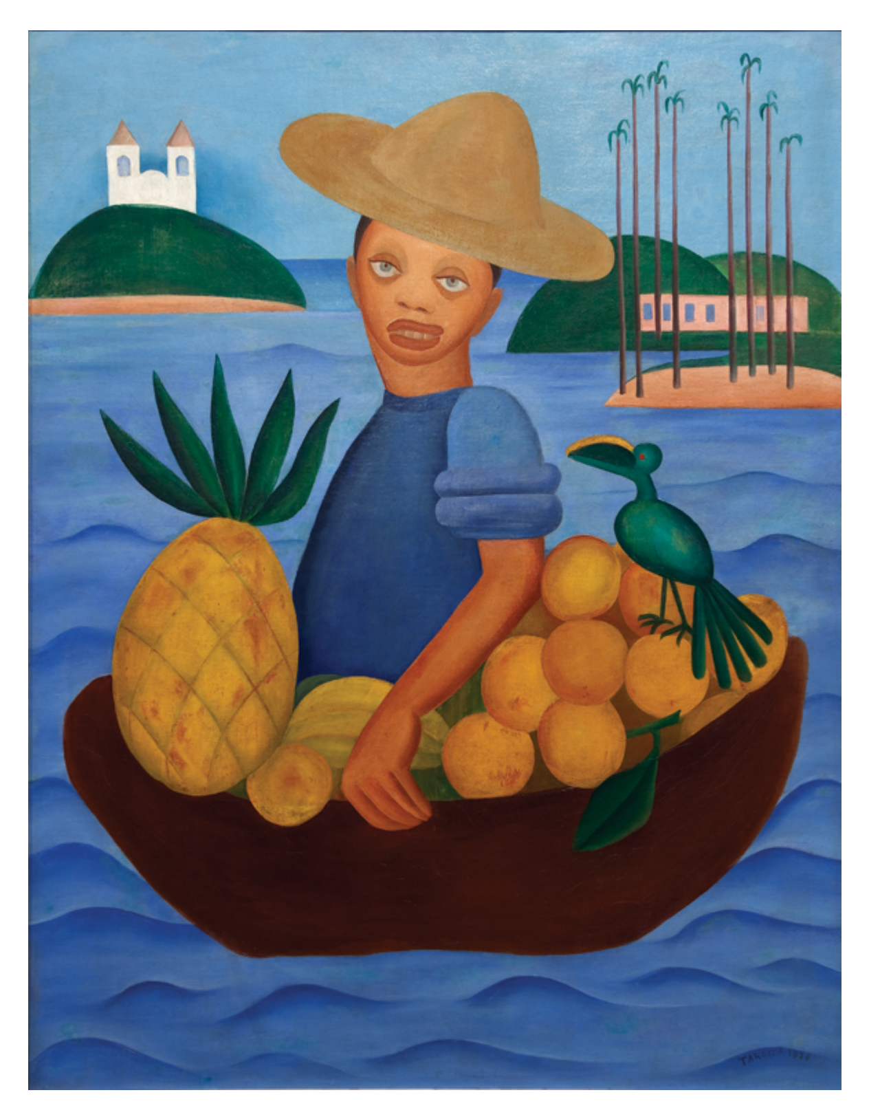
Tarsila do Amaral (Brazil), O Vendedor de frutas ('The Fruit Vendor'), 1925.