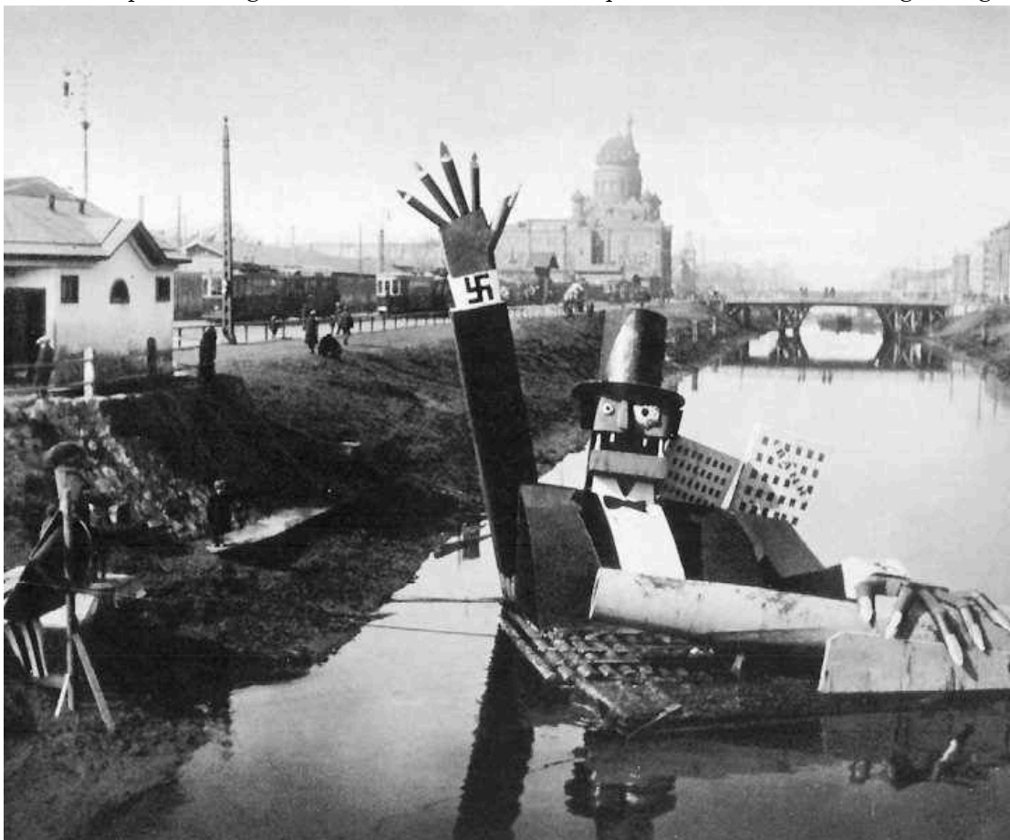
May Day anti-fascist art installation on the Obvodny Canal, Leningrad, USSR, 1932.

Nekhlyudov cannot save Maslova. Nor can he save the line of emaciated prisoners who march out of their frozen prisons and die on the streets. ‘Man owes no humanity to man’, said the Count. Tolstoy could only end the novel with the hope of a Kingdom of Heaven on Earth, with quotes from the Bibles swirling through the Count’s head.