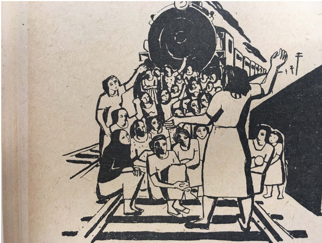
Brazil Women's Federation, woodcut 1950s.

Tolstoy's novel could not solve the problem for Maslova. But the novel brought inhumanity to the surface. That is, in broad terms, the purpose of art. Art does not change the world by itself. Reading a novel or looking at a design can draw our attention to problems and can even provide an understanding of them. But it cannot by itself change the world. Art and literature alert us to the contradictions in our world, show us how these contradictions – such as of Maslova's imprisonment – cannot be overcome by good, liberal feelings. Struggles are needed. Nekhlyudov knows that. The prisons uphold 'class interests', he says, referring to the interests of the class of the aristocracy and the industrialists. The interests of other classes – of the workers, such as Maslova – were suppressed. Art revealed the suppression. Struggle would take that revelation further.