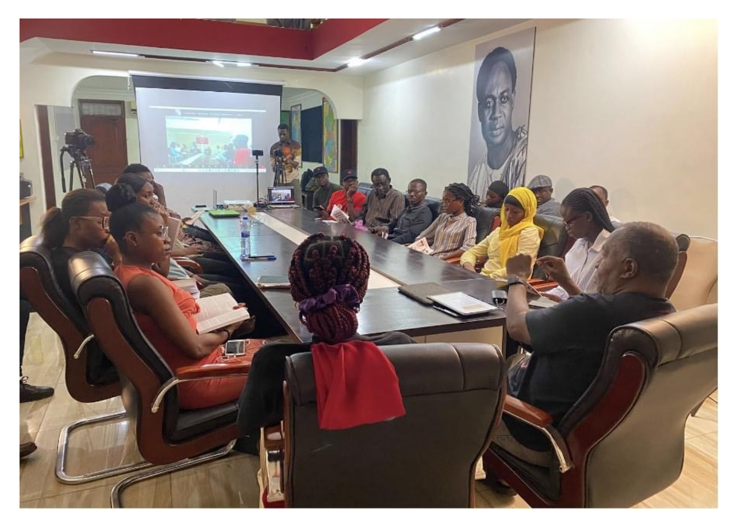
A Red Books Day event organised by the Socialist Movement in Accra (Ghana), 2024.

It was clear that the scope of events held in 2024 would eclipse our previous attempts given the width and depth of participation. Public events were organised by socialist forces in Indonesia and East Timor while the Havana Book Fair in Cuba set aside 21 February for a special day of events. Readings of red books were held by the Socialist Movement of Ghana and the Landless Workers' Movement of Brazil (MST), as well as by Red Ant in Australia and the Workers' Party in Bangladesh. Communists in small villages in Nepal convened meetings in the high mountains to discuss the importance of study and struggle. In New York City, The People's Forum held a celebration on the life and writings of the communist Claudia Jones, while in Chile speeches of Salvador Allende were read at La Cafebrería and in South Africa a discussion was held at The Commune about how the imperialist powers use the concept of human rights. The Communist Party of Ireland organised readings and a workshop in the cultural centre Aonach Mhacha, and the UK Young Communist League and a group from the Students' Federation of India organised a film screening of The Young Karl Marx at the University of Southampton.