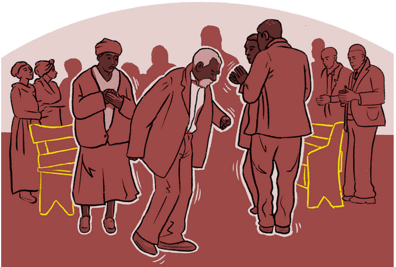
Reference photograph: Doing the Ring Shout in Georgia, ca. 1930s