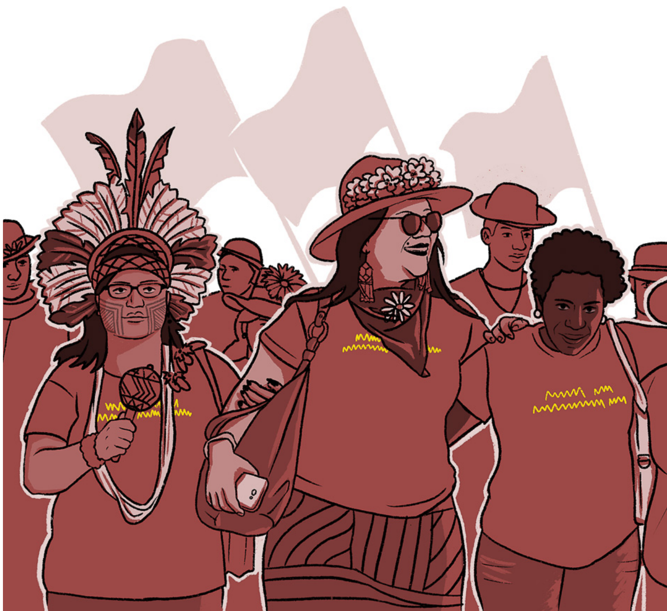
Reference photograph: The March of Daisies ( Marcha das Margaridas), a public action in Brasilia in 2019 involving more than 100,000 women