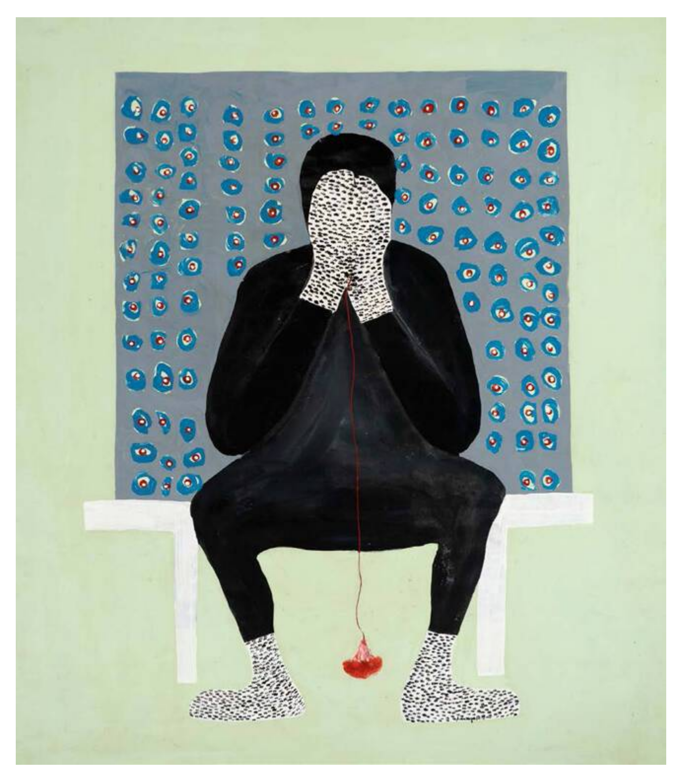
Amadou Sanogo (Mali), You Can Hide Your Gaze, but You Cannot Hide That of Others , 2019.