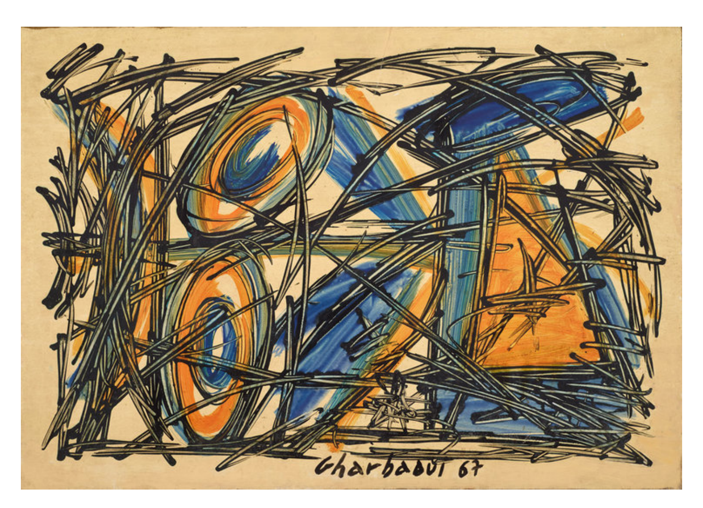
Jilali Gharbaoui (Morocco), Composition, 1967.

A third long-running fragility is that most African states have little freedom to manage their budgets as debt burdens rise and repayment costs increase. 'Public debt ratios are at their highest level in over two decades and many low-income countries are either in, or close to, debt distress', said Abebe Aemro Selassie, the director of the African Department at the International Monetary Fund (IMF). The IMF's Regional Economic Outlook report , released in April 2022, makes for grizzly reading, its headline clear: 'A New Shock and Little Room to Manoeuvre'.