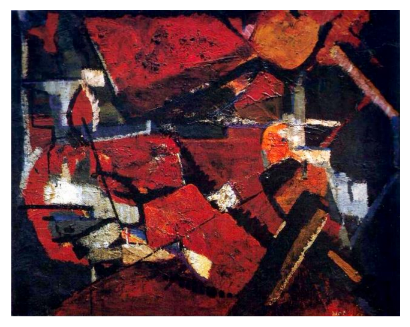
Choukri Mesli (Algeria), Algeria in Flames, 1961.

We live in one of the poorest places on earth', former President of Mali Amadou Toumani Touré told me just before the pandemic. Mali is part of the Sahel region of Africa, where 80% of the population lives on less than $2 a day. Poverty will only intensify as war, climate change, national debt, and population growth increase. At the 7th Summit of the leaders of the G5 Sahel (Group of Five for the Sahel) in February 2021, the heads of state called for a 'deep restructuring of debt', but the silence they received from the IMF was deafening. The G5 Sahel was initiated by France in 2014 as a political formation of the five Sahel countries – Burkina Faso, Chad, Mali, Mauritania, and Niger. Its real purpose was clarified in 2017 with the formation of its military alliance (the G5 Sahel Joint Force or FC-G5S), which provided cover for the French military presence in the Sahel. It could now be claimed that France did not really invade these countries, who maintain their formal sovereignty, but that it entered the Sahel to merely assist these countries in their fight against instability.