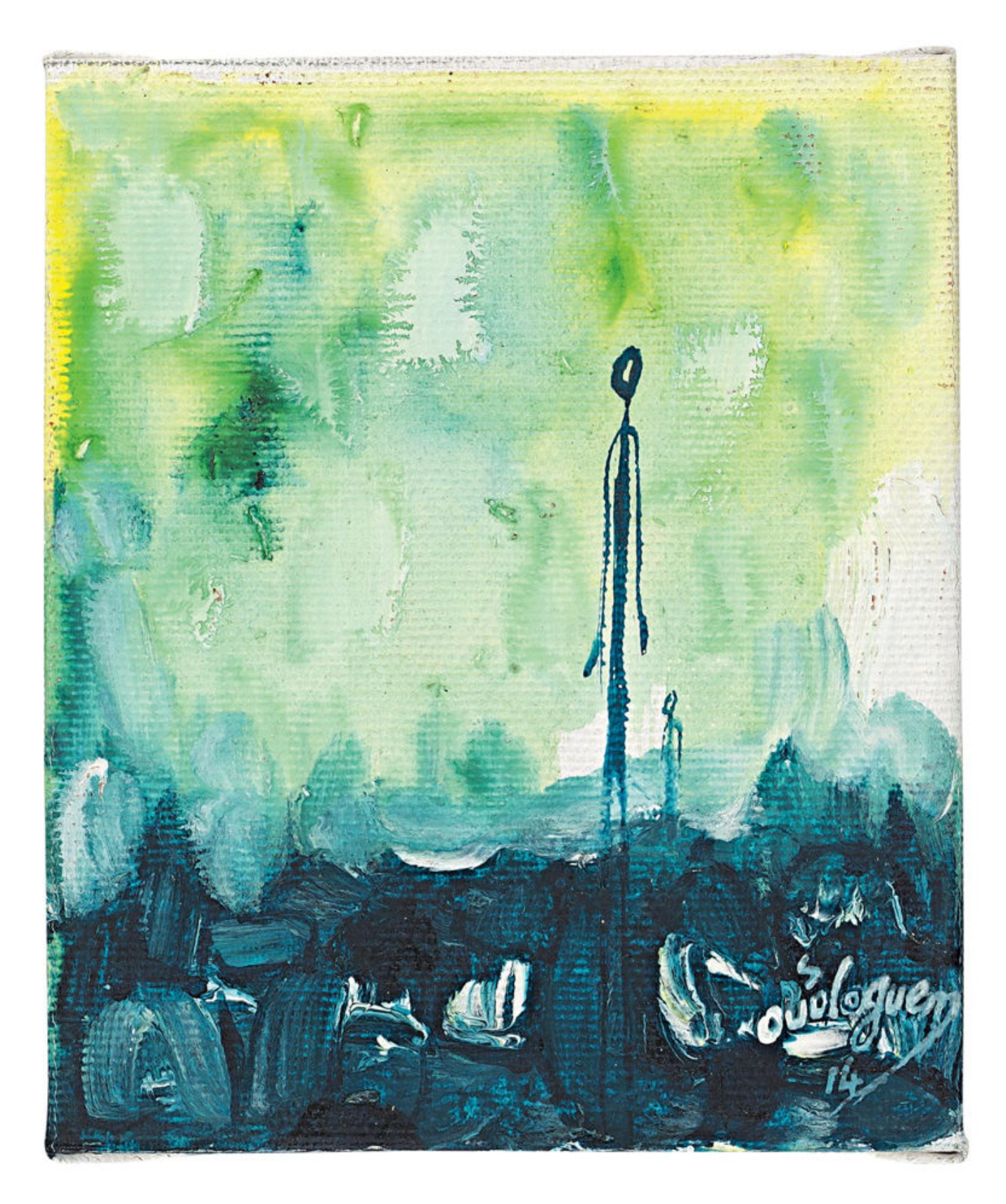
Souleymane Ouologuem (Mali), The Foundation , 2014.