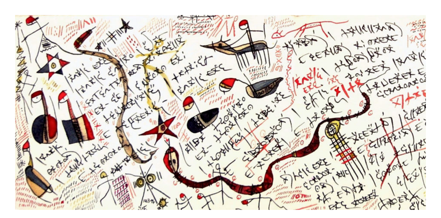
Hawad (Niger), Untitled, 1997.

Travel through this region makes it clear that French – and US – interests in the Sahel are not merely about terrorism and violence. Two domestic concerns have led both foreign powers to build a massive military presence there, including the world's largest drone base, which is operated by the US, in Agadez, Niger. The first concern is that this region is home to considerable natural resources, including yellowcake uranium in Niger. Two mines in Arlit (Niger) produce enough uranium to power one in three light bulbs in France, which is why French mining firms (such as Areva) operate in this garrison-like town. Secondly, these military operations are designed to deter the steady stream of migrants leaving areas such as West Africa and West Asia, going through the Sahel and Libya and making their way across the Mediterranean Sea to Europe. Along the Sahel, from Mauritania to Chad, Europe and the US have begun to build what amounts to a highly militarised border. Europe has moved its border from the northern edge of the Mediterranean Sea to the southern edge of the Sahara Desert, thereby compromising the sovereignty of North Africa.