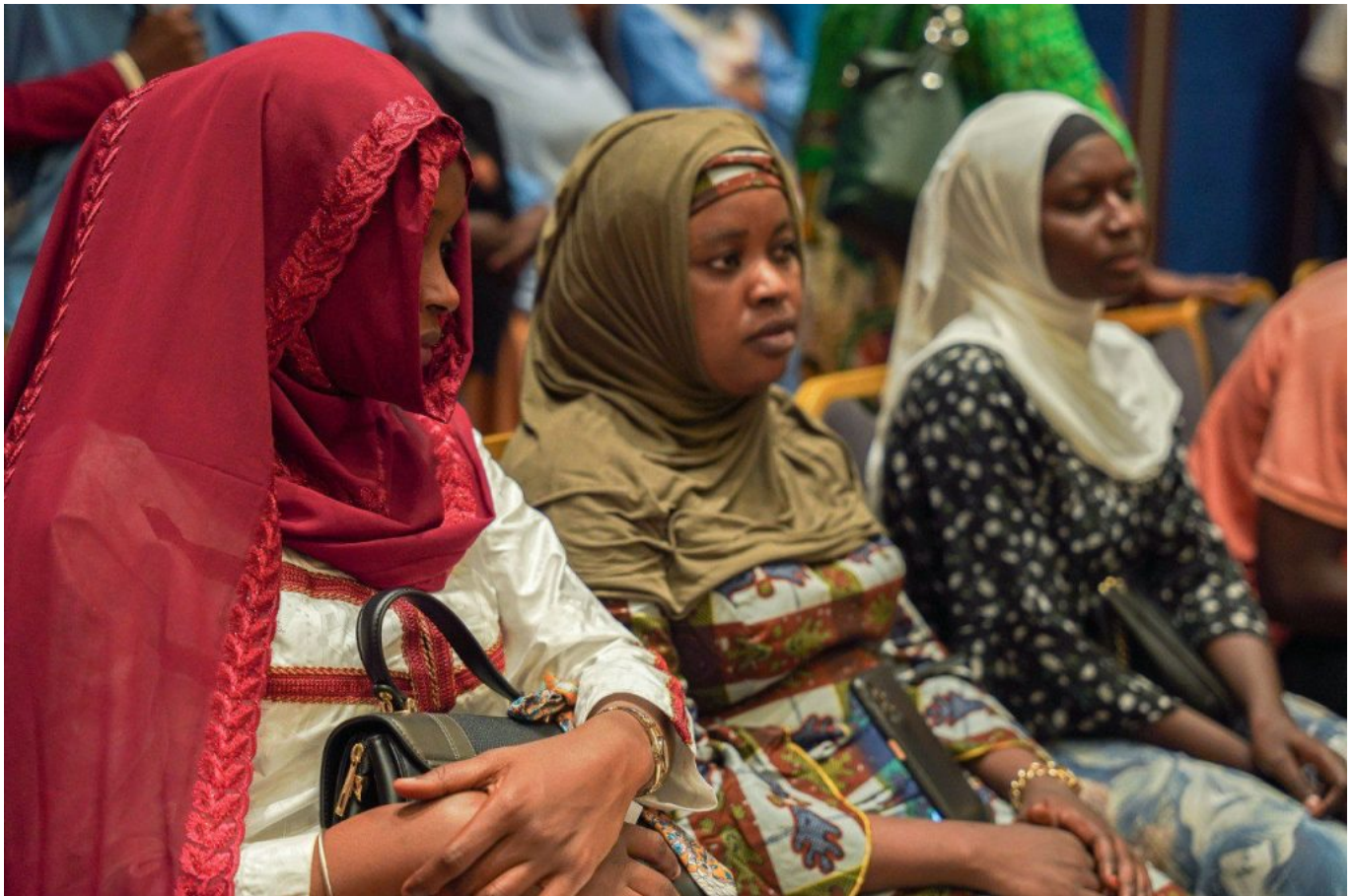
Conference in Solidarity with the Peoples of the Sahel, Niamey, Niger.

strides made by the government of Prime Minister Ali Lamine Zeine, a former minister of finance, but that the people must be vigilant and the government must be transparent.