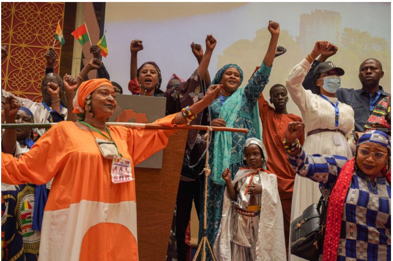
Conference in Solidarity with the Peoples of the Sahel, Niamey, Niger.

If people are not allowed to be ‘themselves’ or free, Fanon wrote around the same time, then they will rebel. ‘The masses begin to sulk’, he wrote in The Wretched of the Earth . ‘They turn away from this nation in which they have been given no place and begin to lose interest in it’. The false nationalists, or flag nationalists, Fanon wrote, ‘mobilise the people with slogans of independence, and for the rest leave it to future events’. Six decades later, we are now in the midst of these ‘future events’.