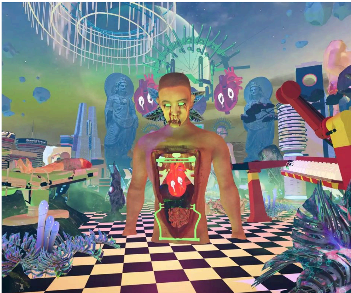
Lu Yang (China), Delusional World - Bardo #1 , 2021.