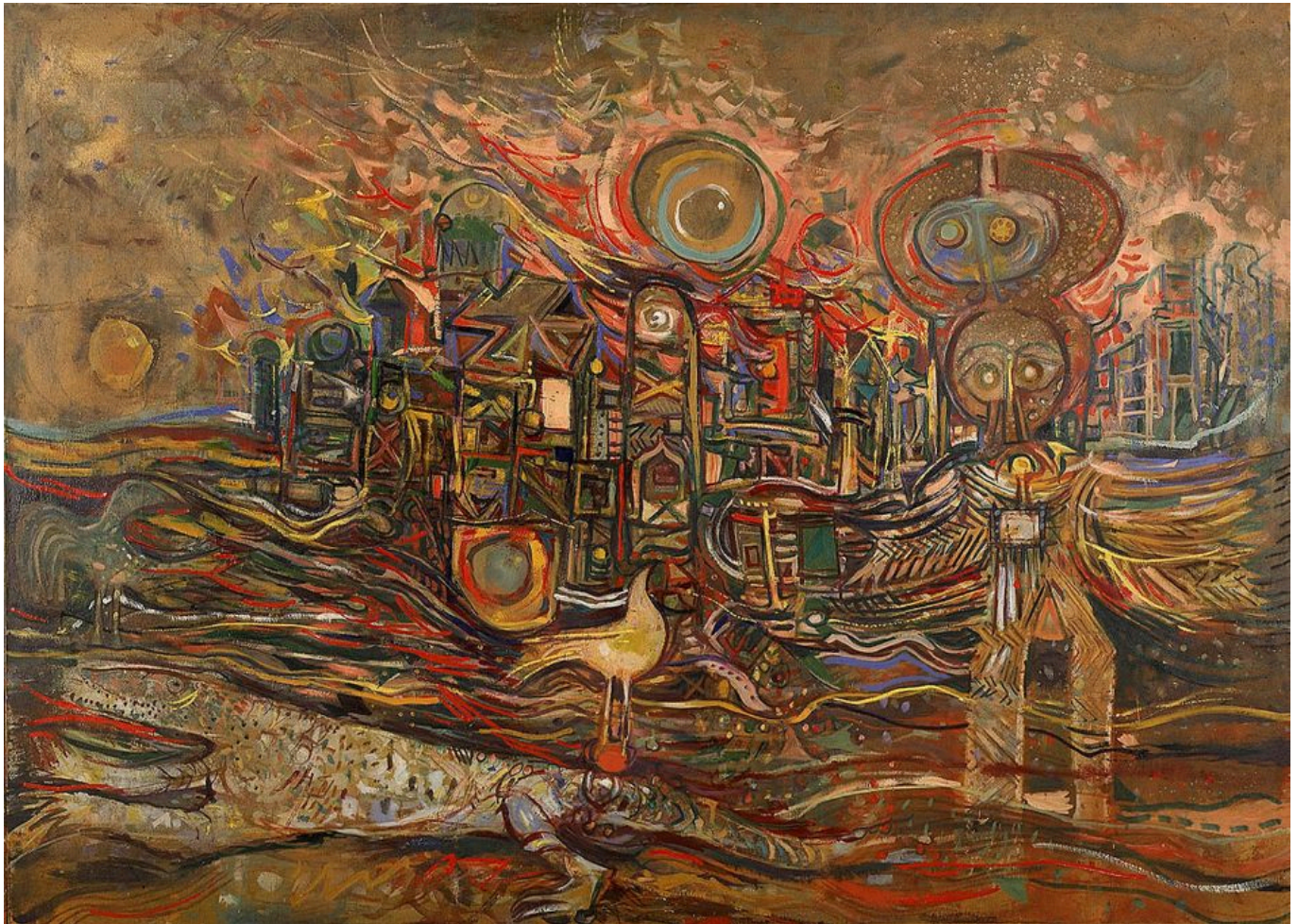
Skunder Boghossian (Ethiopia), The End of the Beginning , 1972-73.

Unsurprisingly, while the US has been able to consolidate support for its agenda amongst a number of its Western allies, its efforts have failed across the Global South. It is in the interest of developing countries for such advanced technologies to be dispersed as widely as possible – not to be controlled by a select few states.