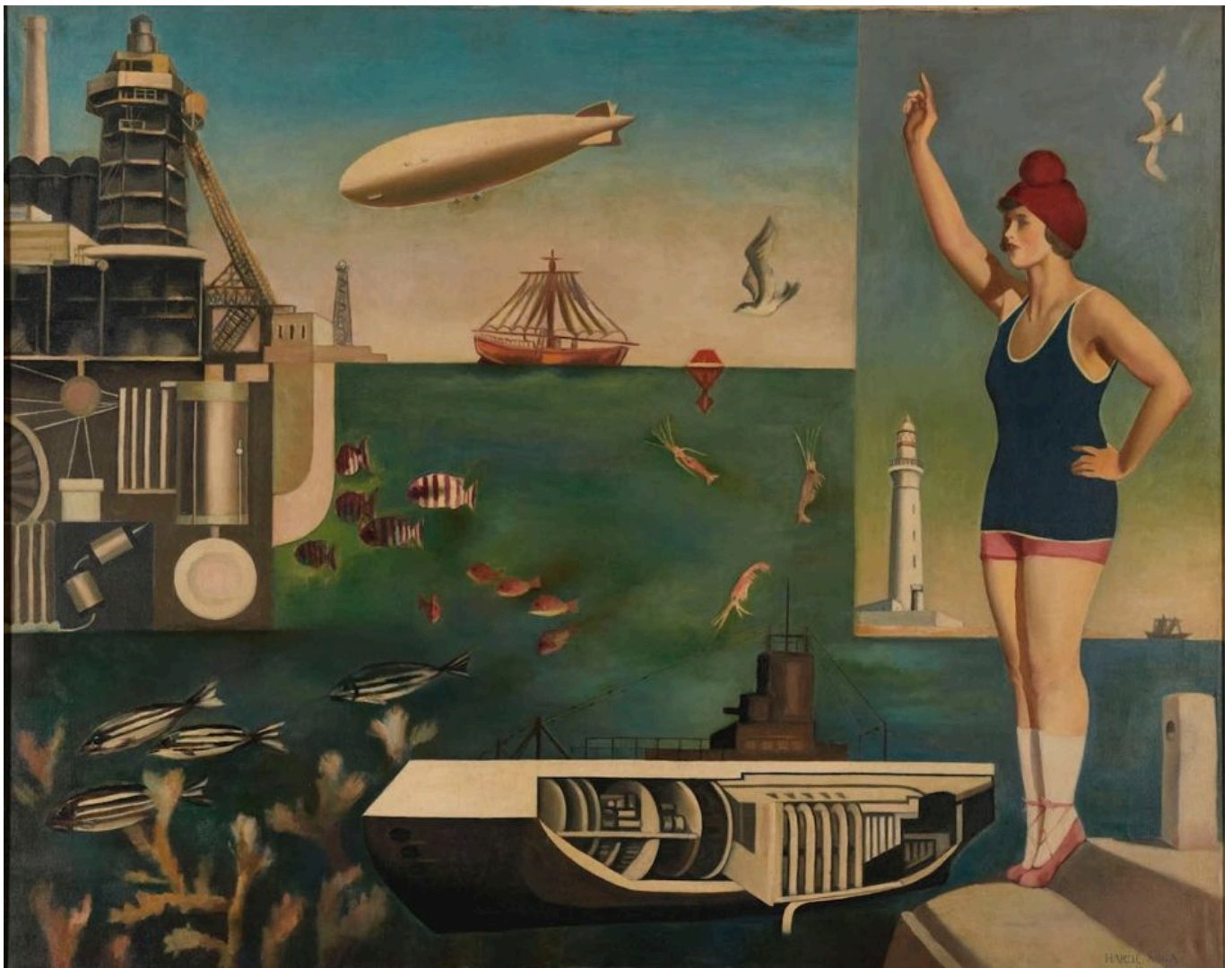
Koga Harue (Japan), Umi ('The Sea'), 1929.