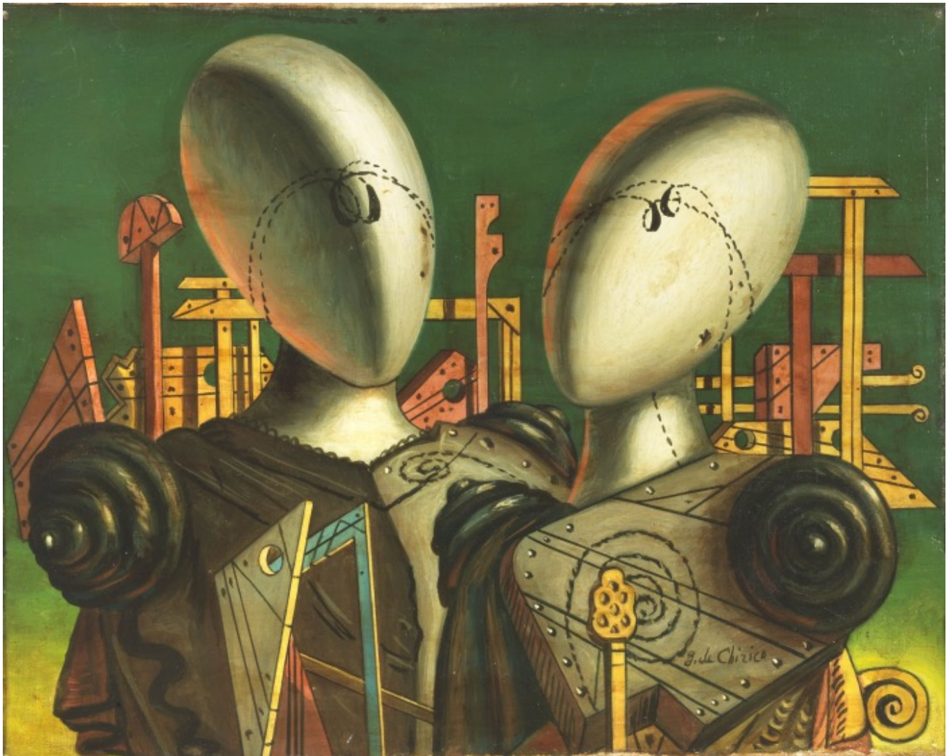
Giorgio de Chirico (Italy), Ettore e Andromaca ('Hector and Andromache'), 1955-56.