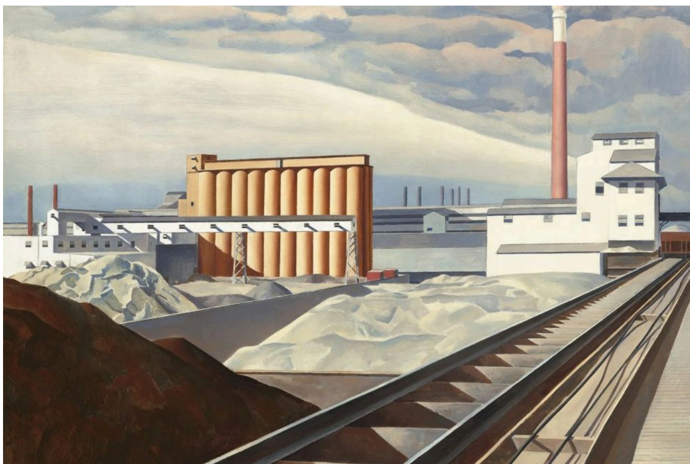
Charles Sheeler (United States), Classic Landscape , 1931.

intelligence, 5G telecommunications, and supercomputing) as well as all modern electronics. Without them, the computers, phones, cars, and devices that are essential to our everyday lives would cease to function. They are typically produced by using ultraviolet light to etch microscopic circuit patterns onto thin layers of silicon, packing billions of electrical switches called transistors onto a single fingernail-sized wafer. This technology advances through a relentless process of miniaturisation: the smaller the distance between transistors, the greater the density of transistors that can be packed onto a chip and the more computing power that can be embedded in each chip and in each facet of modern life. Today, the most advanced chips are produced with a three-nanometre (nm) process (for reference, a sheet of paper is roughly 100,000-nm thick).