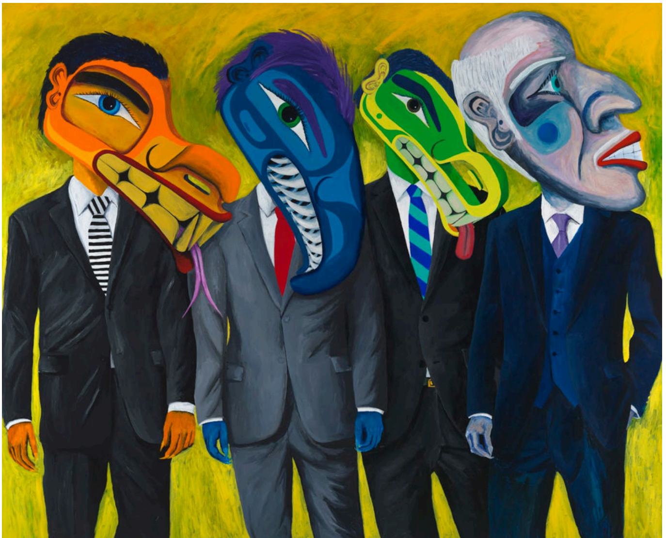
Lawrence Paul Yuxweluptun (Canada), The One Percent , 2015.

To understand the current global situation, here are six theses about the establishment of the US-shaped world order from 1990 to the current fragility of that order in the face of growing Russian and Chinese power. These theses are drawn from our analysis in dossier no. 36 (January 2021), Twilight: The Erosion of US Control and the Multipolar Future ; they are intended for discussion and so feedback on them is very welcome.