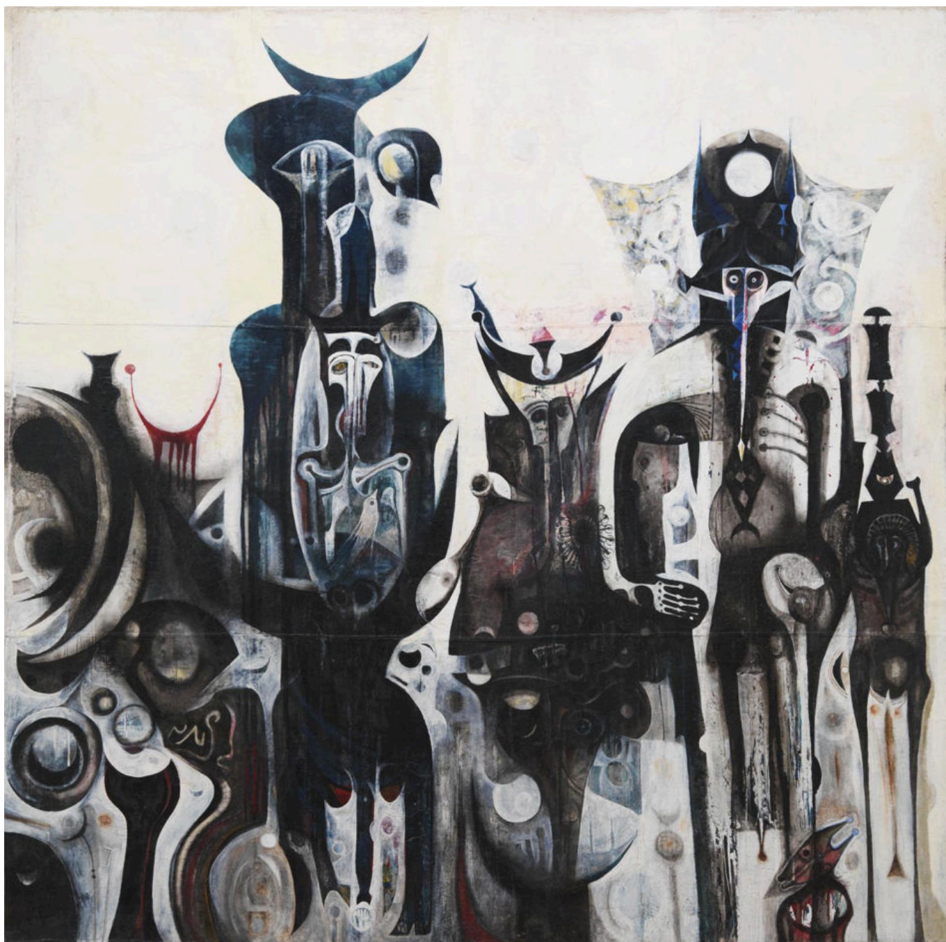
Ibrahim el-Salahi (Sudan), Reborn Sounds of Childhood Dreams I , (1961-65).

Thesis Four: Global Monroe Doctrine. The United States took its 1823 Monroe Doctrine (that asserted its control over the Americas) global and proposed in this post-Soviet era that the entire world was its dominion. It began to push back against the assertion of China (Obama’s Pivot to Asia) and Russia (Russiagate and Ukraine). This New Cold War driven by the US, which includes hybrid warfare through sanctions against thirty countries such as Iran and Venezuela, has destabilised the world.