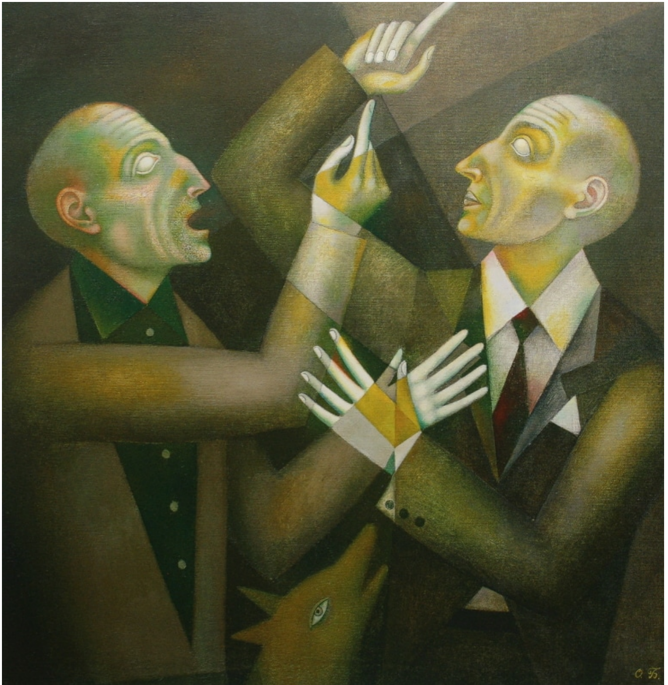
Olga Bulgakova (Russia), Blind Men , 1992.

Thesis Three: Sino-Russian Emergence. By the second decade of the 2000s, for different reasons, both China and Russia emerged from their relative dormancy.