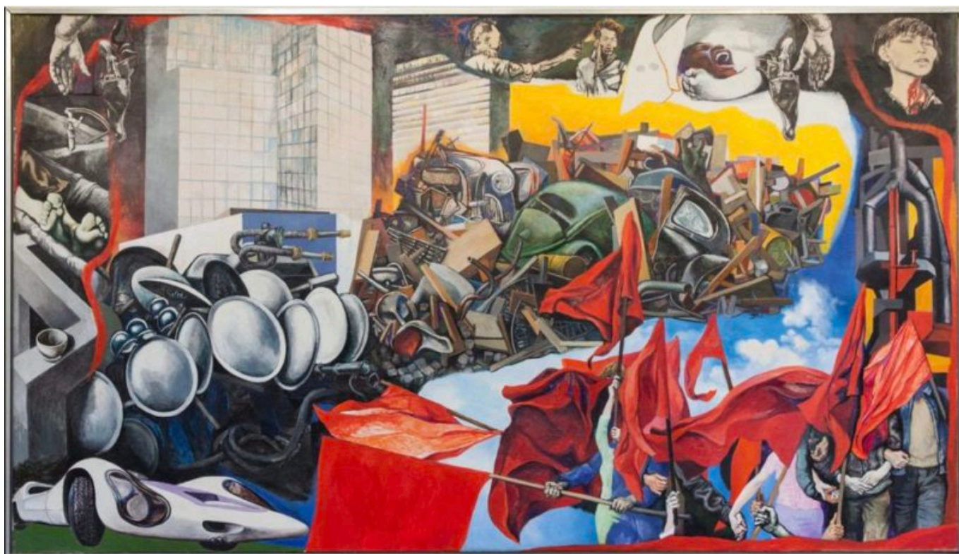
Renato Guttuso (Italy), May 1968 , 1968.

The problems we face are not for lack of resources or lack of technological and scientific knowhow. At Tricontinental: Institute for Social Research, we believe that it is because of the social system of capitalism that we are unable to transcend our common problems. This system constrains the forward movement that requires the democratisation of nations and the democratisation of social wealth. There are hundreds of millions of people organised into political and social formations that are pushing against the gated communities in our world, fighting to break down the barriers and build the utopias that we require to survive. But, rather than recognise that these formations seek to realise genuine democracy, they are criminalised, their leaders arrested and assassinated, and their own precious social confidence vanquished. Much the same repressive behaviour is meted out to national projects that are rooted in such political and social movements, projects that are committed to using social wealth for the greatest good. Coups, assassinations, and sanctions regimes are routine, their frequency illustrated by an unending sequence of events, from the coup in Peru in December 2022 to the ongoing blockade of Cuba, and by the denial that such violence is used to block social progress.