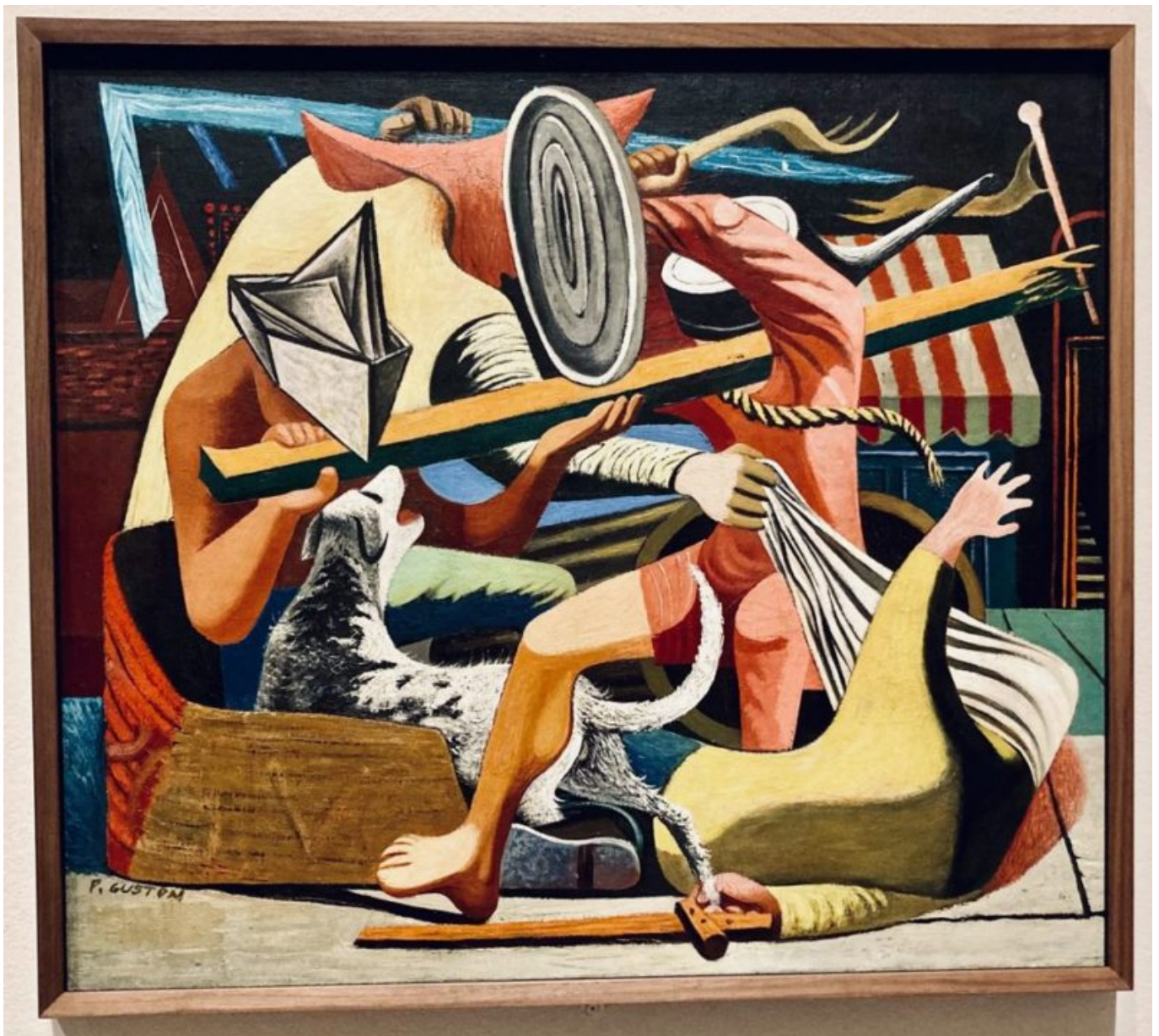
Philip Guston (Canada), Gladiators , 1940.